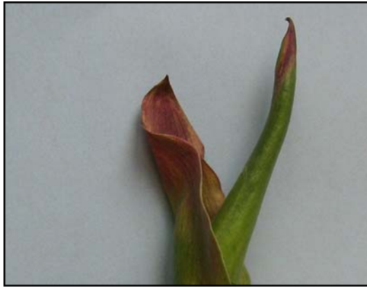
Figure 4: Leaf tip symptom that may indicate infection of the root system and/or bulb