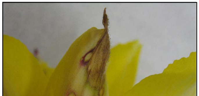
Figure 3: Close-up showing gray fungus on infected petal

Outer bulb scales may also become infected and show yellow to brown, somewhat sunken, circular lesions. Small, shiny black sclerotia, resting structures of the fungus, may be found develop on rotting leaf, flower, stem, and bulb tissue.