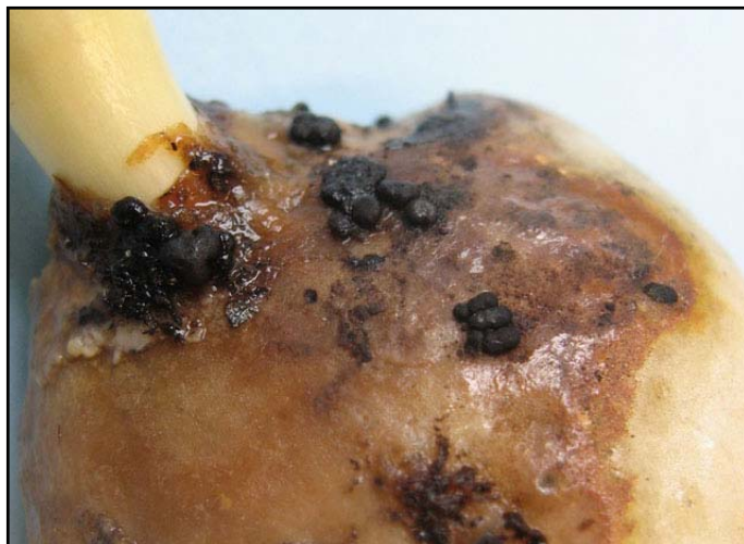
Figure 6: Close-up of sclerotia on infected bulb