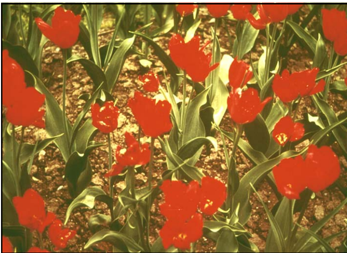
Figure 1: Tulip planting.

Botrytis blight or gray mold is a fungus disease which infects a wide array of herbaceous annual and perennial plants. There are several species of the fungus Botrytis which can cause blights; the most common is Botrytis cinerea . Botrytis infections are favored by cool (60°F or 15°C), rainy spring and summer weather. Gray mold can be particularly damaging when rainy, drizzly weather continues over several days. A Botrytis blight fungus with a strict host preference is Botrytis tulipae which infects tulip causing the disease known as tulip fire.