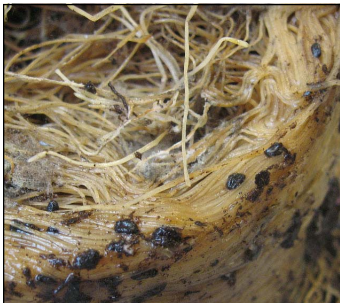
Figure 4: Botrytis mold and sclerotia on infected roots of potted plants