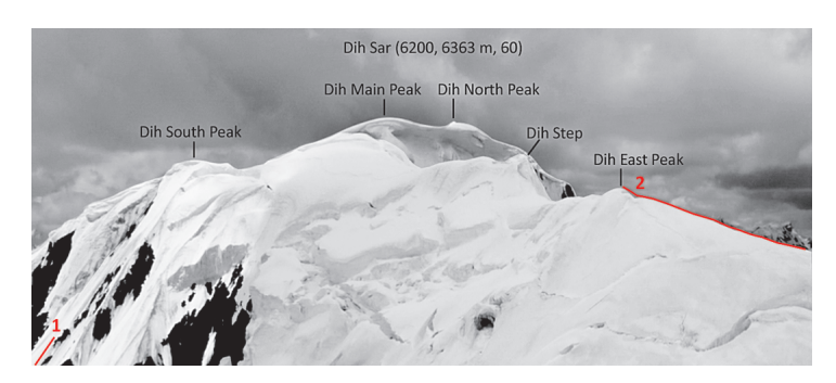
Drone photo of the summit area of Dih Sar.