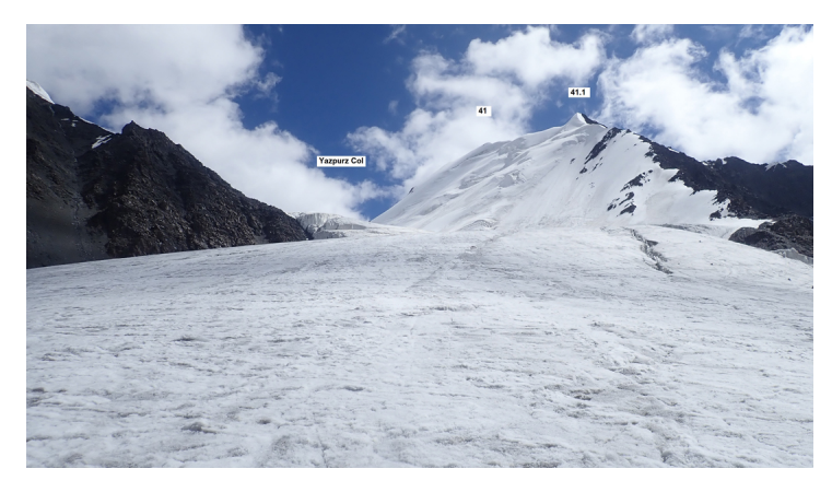
Yazpurz Col from the First Ice Flow with unclimbed tops to the right, Peak 41 being around 6,000m.