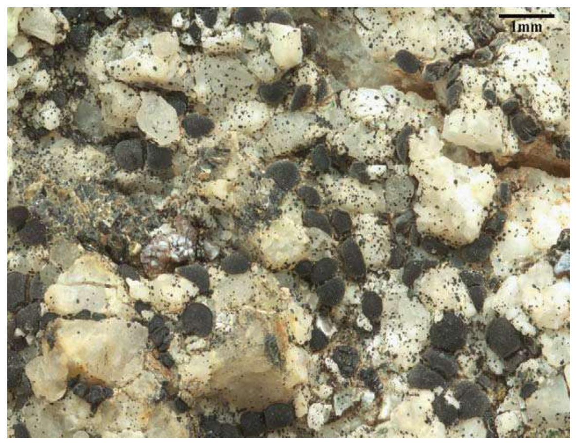
Buellia abstracta.