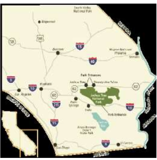
Location of Joshua Tree National Park in Southern California