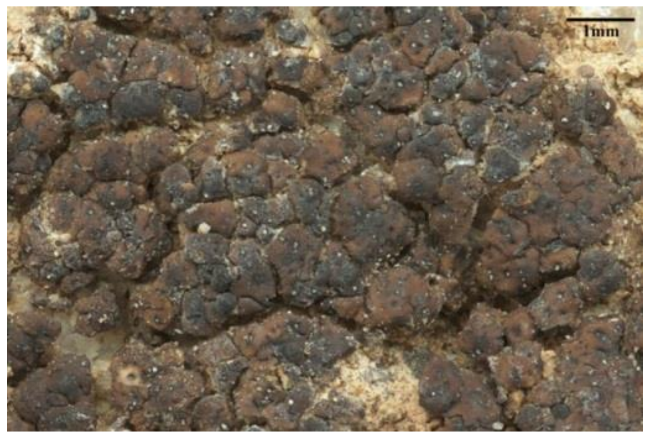
Heteroplacidium compactum.