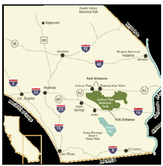
Location of Joshua Tree National Park in Southern California

Known distribution of Heteroplacidium compactum in JTNP.