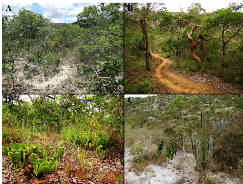
Figure 3. Environments where specimens of Psilophthalmus paeminosus were found at Parque Estadual de Grão Mogol, State of Minas Gerais, southeastern Brazil. Clockwise from upper left: A - closed, tall-shrubby, xerophilous vegetation on quartz sand soil; B - arboreal savannah, typical of the Brazilian Cerrado; C - open vegetation on sandy soil, with emphasis on the cactus Pilosocereus fulvilanatus ; D - leaf-litter in arboreal savannah, with emphasis on the “palm cactus” Tacinga inamoena .