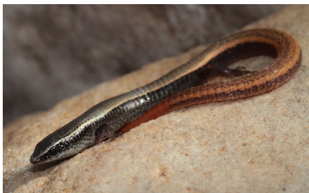
Figure 1. A female (SVL 37.5 mm) Psilophthalmus paeminus (UFMG-2221) found at Parque Estadual de Grão Mogol (-16.591117°, -42.961696°), State of Minas Gerais, Brazil.