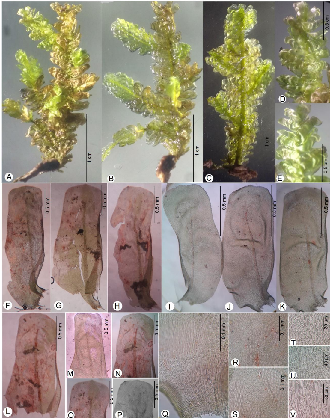
Plate 1. A. Dried Branch, B & C. Wet Branches, D & E. Magnified view of a portion of branch, F-H. Stem Leaves, I-L. Branch Leaves, M-P. Magnified view of different types of leaf tips, Q. Stem leaf basal cells, R. Stem leaf middle cells, S. Stem leaf apical cells, T. Branch leaf apical cells, U. Branch leaf middle cells and V. Branch leaf basal cells.