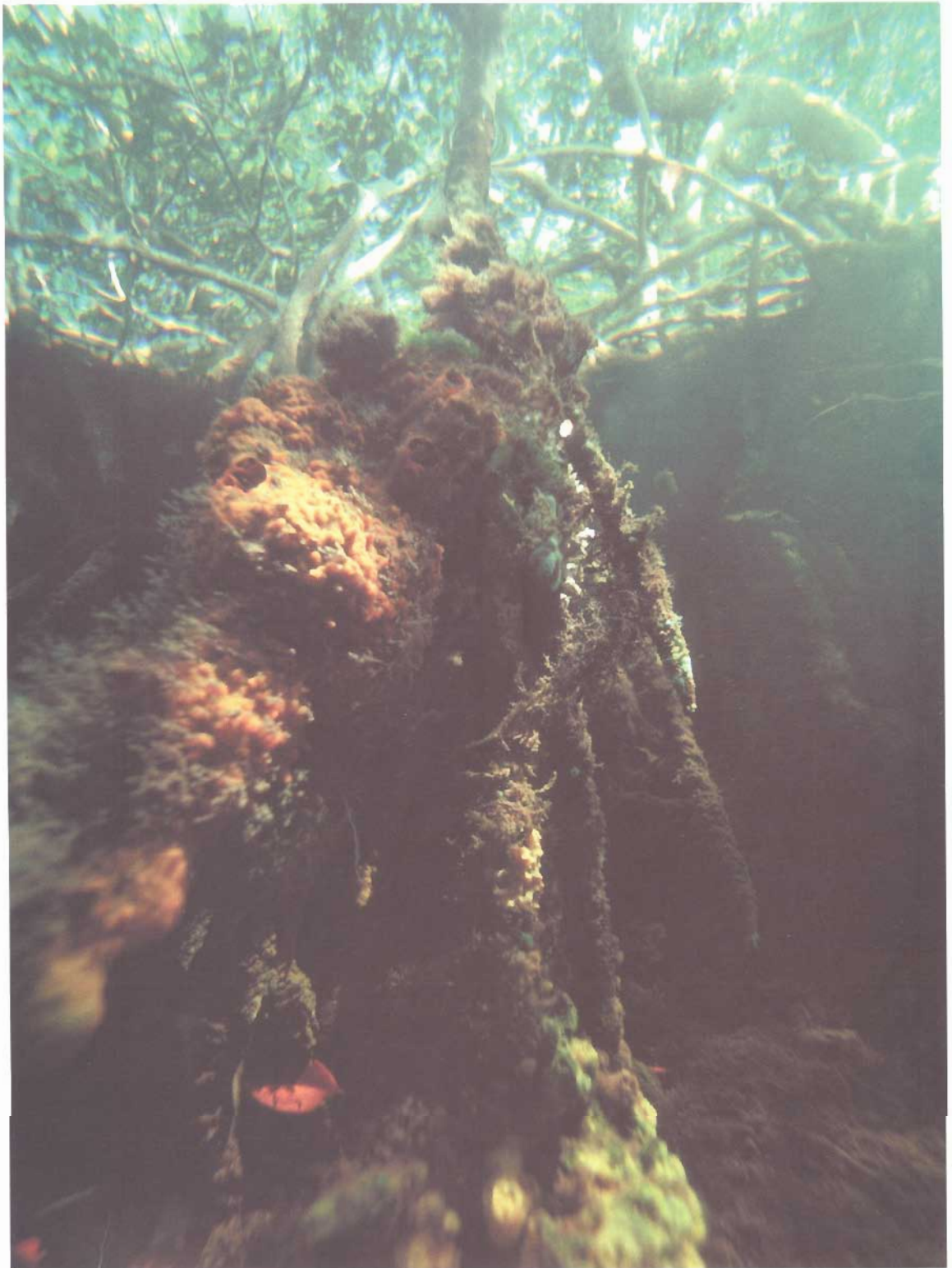
The Caribbean fire sponge ( Tedania ignis ) is a prominent member of the red-mangrove root community at Twin Cays and throughout the region. It contains a toxin that may cause severe skin irritation in humans but does not affect a rich community of invertebrates, such as entoprocts, polychaetes, crustaceans, and ophiuroid brittle stars which populates its surface and interior spaces.