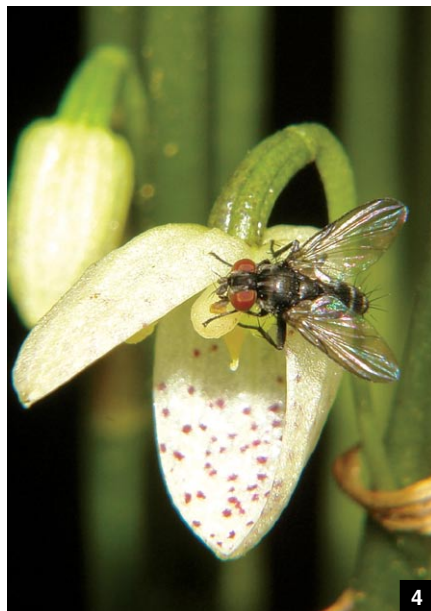
[4] An anthomyiid fly licking the nectar on the surface of a club-shaped petal.

PLEUROTHALLIS COLOSSUS , 1 WHICH is distributed from Costa Rica to Ecuador, is perhaps the largest pleurothallid. Although individual flowers of Pths. colossus are perhaps not the largest for the genus, the size of the leaves and the racemicauls — up to 10½ inches broad and 16½ inches long (26 × 41 cm) and up to 46 inches (115 cm), respectively, hold the record for the genus. (The measurements were made on a full-grown plant at El Refugio Nature Reservation.)