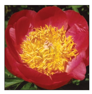
CORAL N' GOLD