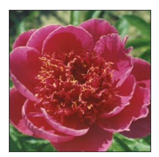
BREAK O' DAY