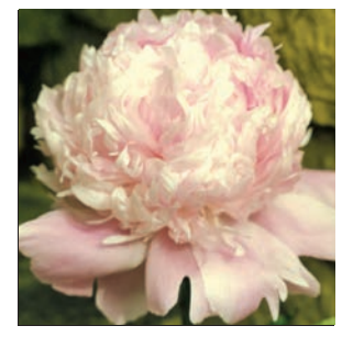
MONS JULES ELIE