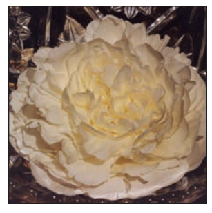
BOWL OF CREAM