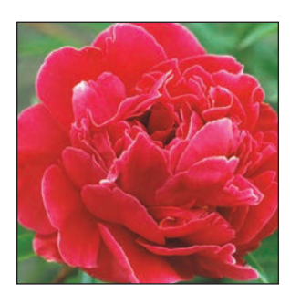
THE MIGHTY MO