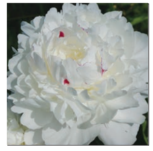
MME EMILE LEMOINE