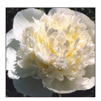
DUCHESS de NEMOURS