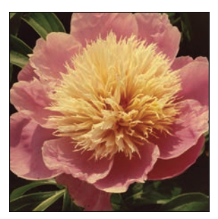
BOWL OF BEAUTY