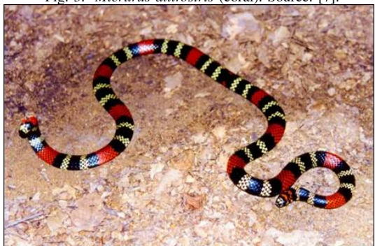
Fig. 3. Micrurus altirostris (coral).

• Spots . The snake shows regular (similar) shapes on its body, often elliptical (see figure 4).