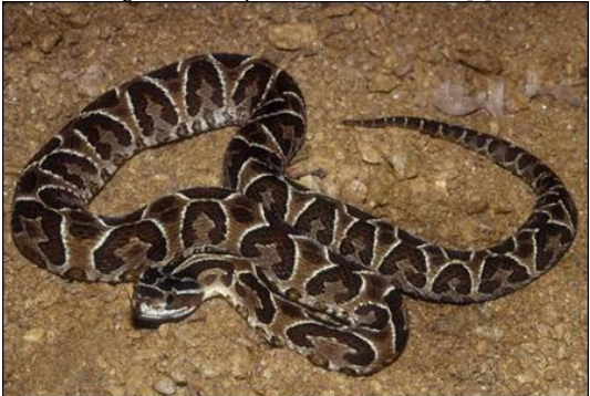
Fig. 5. Bothrops alternatus.

Then, looking at pictures of each snake species, we assigned a single skin pattern category to it. If a snake presents two skin patterns (for example, when a snake's pattern has both