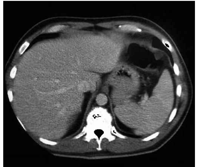
Fig. 3 CT image of the abdomen shows the normal spleen.