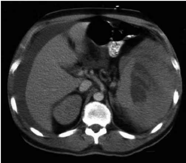
Fig. 1 CT image of the abdomen shows the ruptured spleen and haemoperitoneum.