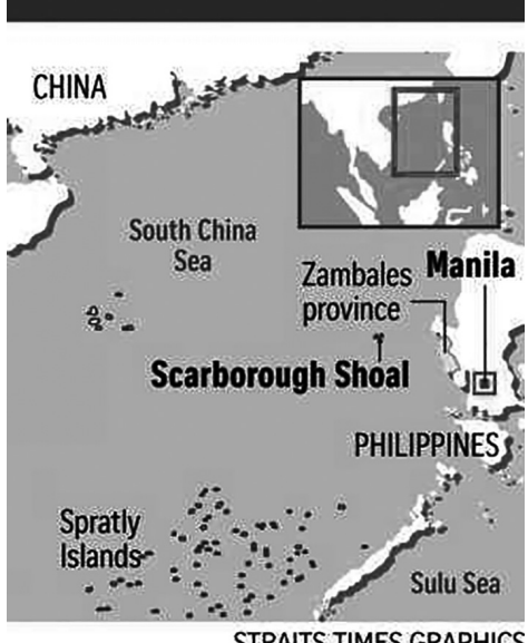
STRAITS TIMES GRAPHICS

From a historical perspective, the Scarborough Shoal has not played a major role and until the 1990s it has had no place in