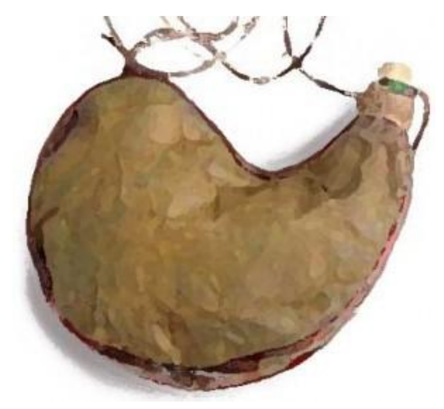
A\ wineskin\ {\tt https://beyondhalfway.files.wordpress.com/2017/02/wineskin-300x274.jpg}