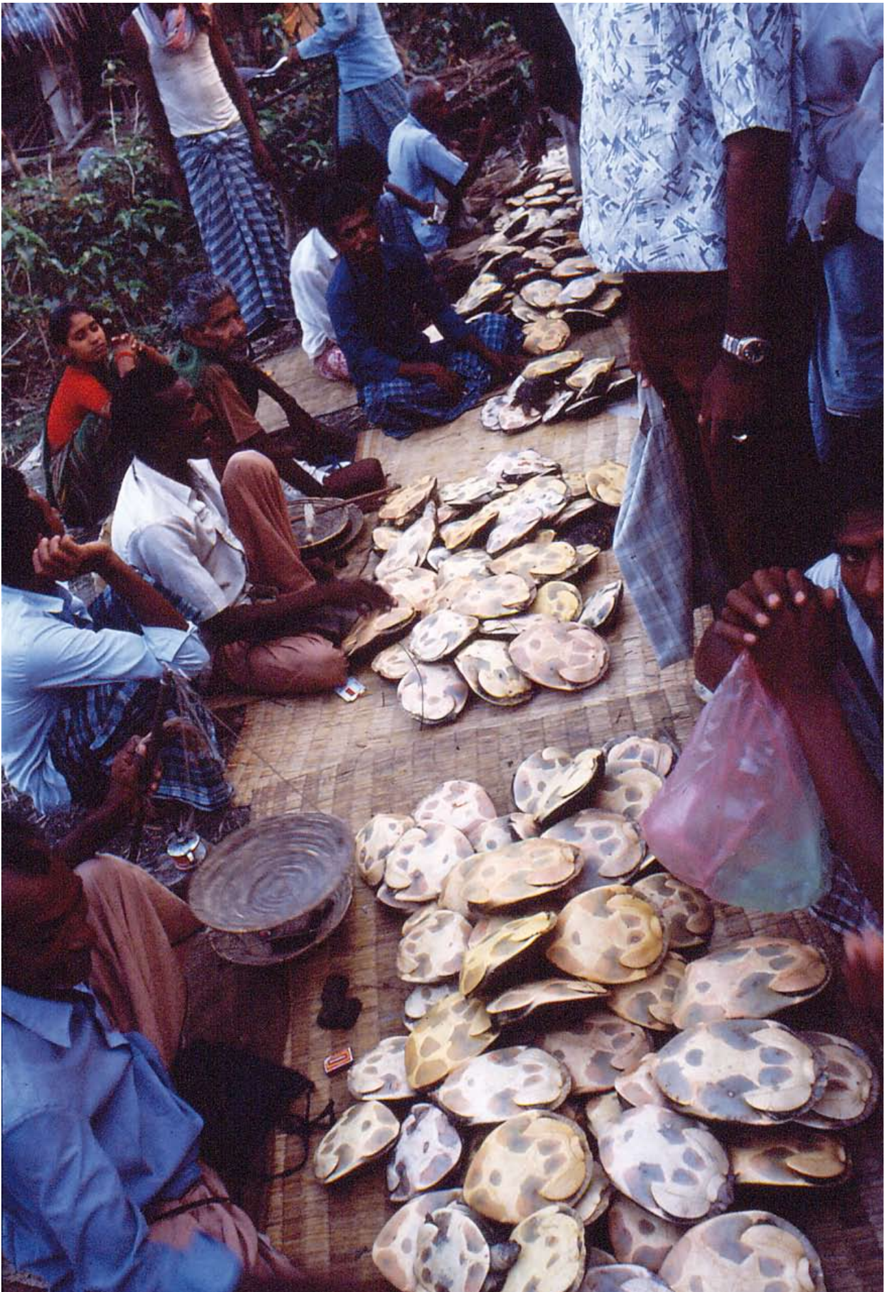
Indian flapshell turtles Lissemys sp. (CITES Appendix II), for sale in the open markets of Bagerhat, Bangladesh.