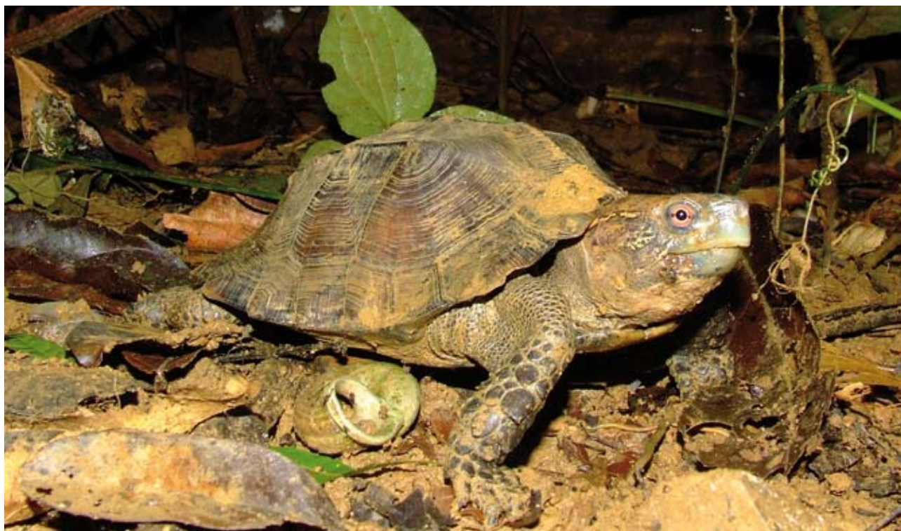
Keel-necked Box Turtle Cuora mouhotii is one of the last rare aquatic Cuora species that are still found occasionally for sale in Chinese markets and attention needs to be placed on securing remaining wild populations of before they are extirpated.