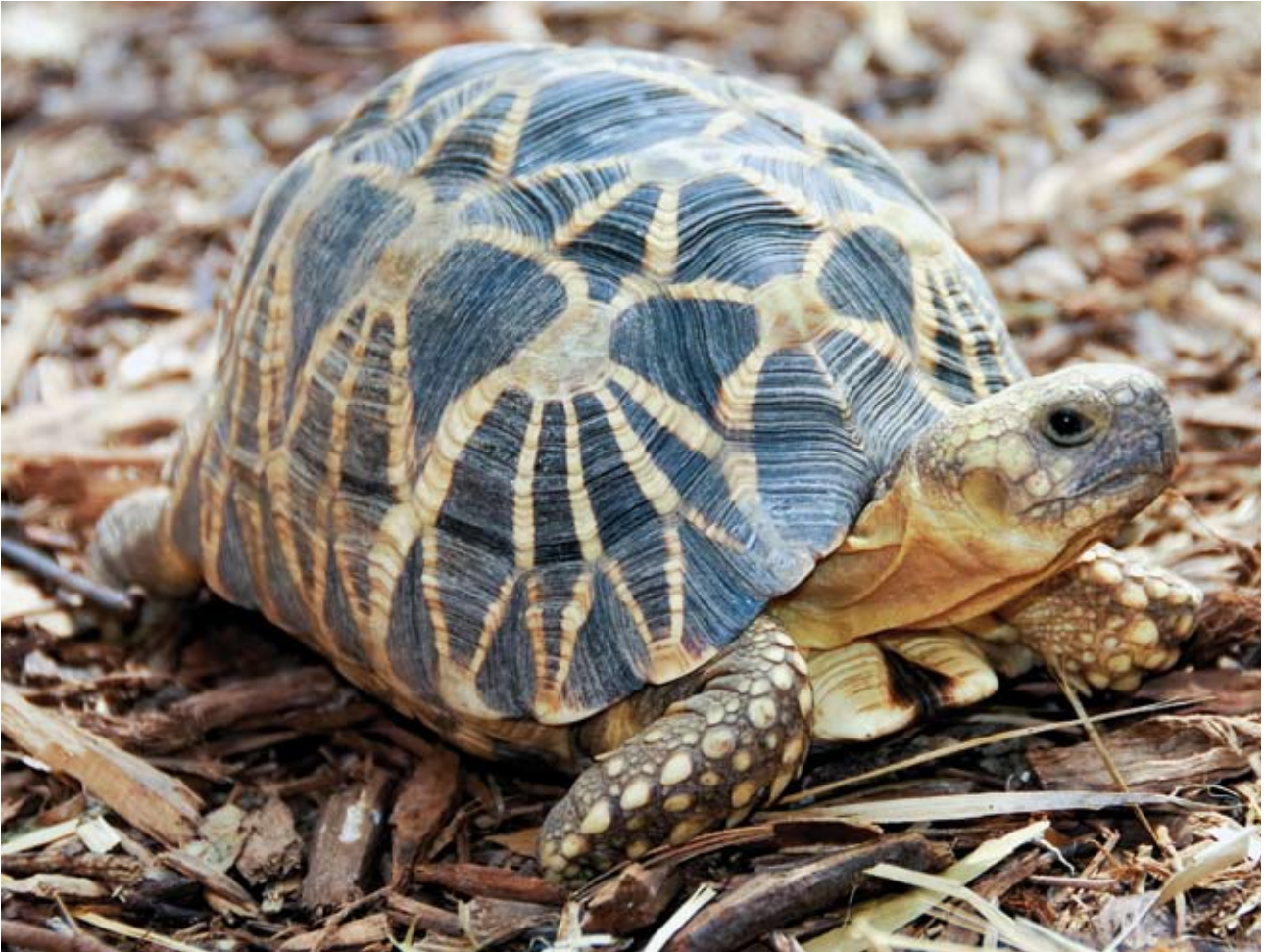
Burmese Star Tortoise Geochelone platynota , functionally extinct in the wild, is at a turning point of its conservation. Preparations are underway to begin re-introducing captive bred juveniles into protect habitats within Myanmar's central dry zone.