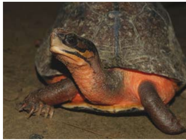
With limited wild populations remaining in Hong Kong and poaching pressures still very high, uplisting Chinese Three-striped Box Turtle Cuora trifasciata to CITES appendix 1 may be warranted to help prevent the poaching of the few remaining wild animals.

Very few animals are believed to remain in the wild, as this species is highly valued in traditional eastern medicine. Turtle farms in mainland China are continuing to purchase