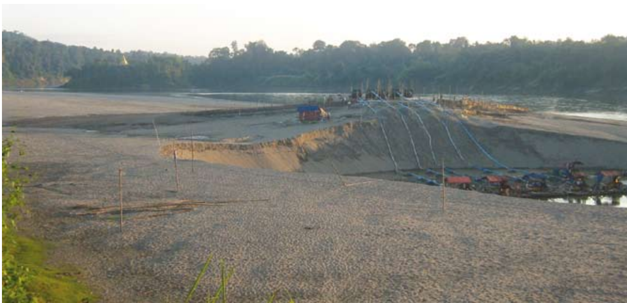
Gold mining along the upper Chindwin River destroys nesting areas for the critically endangered and endemic Burmese Roofed Turtle Batagur trivittata .