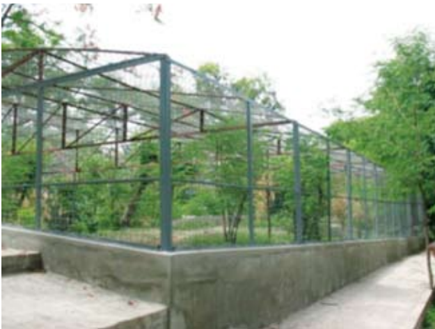
The use of in-range captive breeding facilities for Burmese Star Tortoise Geochelone platynota will play an important role in the re-establishment of wild populations of these tortoises in Myanmar.

Regional training workshops and exchanges need to be conducted and best practice manuals created by NGO's such as TSA, WCS, and WRS in conjunction with members of the Tortoise and Freshwater Specialist Group to ensure proper in-depth planning and operation of rescue centers. Existing materials from KFBG could be adapted for such use.