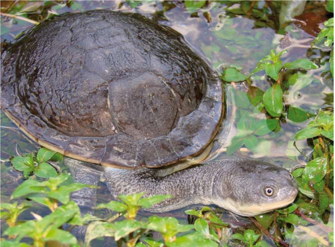
The international pet trade has made Roti Island Snake-necked Turtle Chelodina mccordi extremely rare in the wild. Yet as habitat remains there is potential for offspring produced at US and European zoos to be re-introduced once anti-poacher measures are in place.

Batagur trivittata , Burmese Roofed Turtle Once thought to be extinct, its rediscovery in 2002 underscores the need for additional surveys for this species so that extant wild populations and their habitats can be effectively protected. Besides the on-going conservation efforts on the Chindwin River, there needs to be follow up efforts for conservation of the remnant population that may or may not still exist on the Dokhtawady River. There is a pressing need to diversify the captive holdings of this species as all of the captive individuals are housed within two facilities inside Myanmar. No breeding groups exist outside of Myanmar.