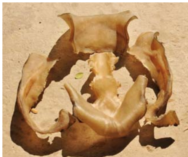
Dried and cleaned calipee from Ganges Softshell Turtles Nilssonia gangeticus is often difficult for customs officials to identify and is frequently labelled "buffalo horn" by smugglers in attempts to hide its identity.

Recent reports from South Asia have shown an increasing trend of trade in the dried calipee (the cartilaginous parts of a softshell turtle's shell) to China where it is consumed in a soup that has rendered the turtle cartilage into a gelatinous substance. Turtles are often slaughtered merely for this cartilage, meat and bones are often not utilized as consumption of these is