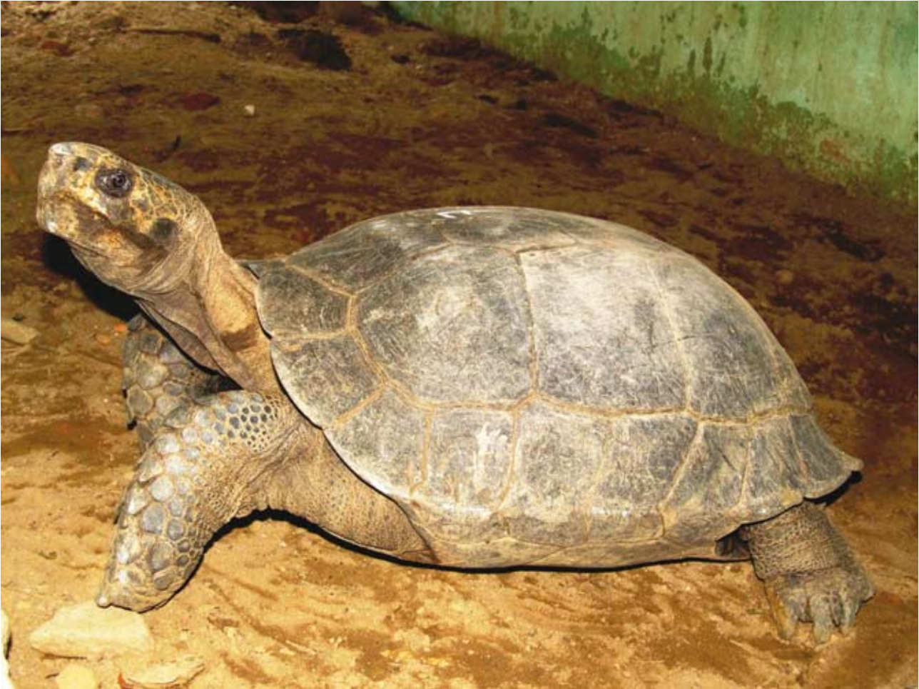
Asian Brown Tortoise Manouria emys as the largest tortoise in Asia is highly sought after for human consumption, particularly during Lunar New Year festivals.