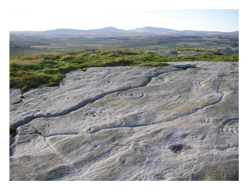
Figure 1 Chatton Park Hill