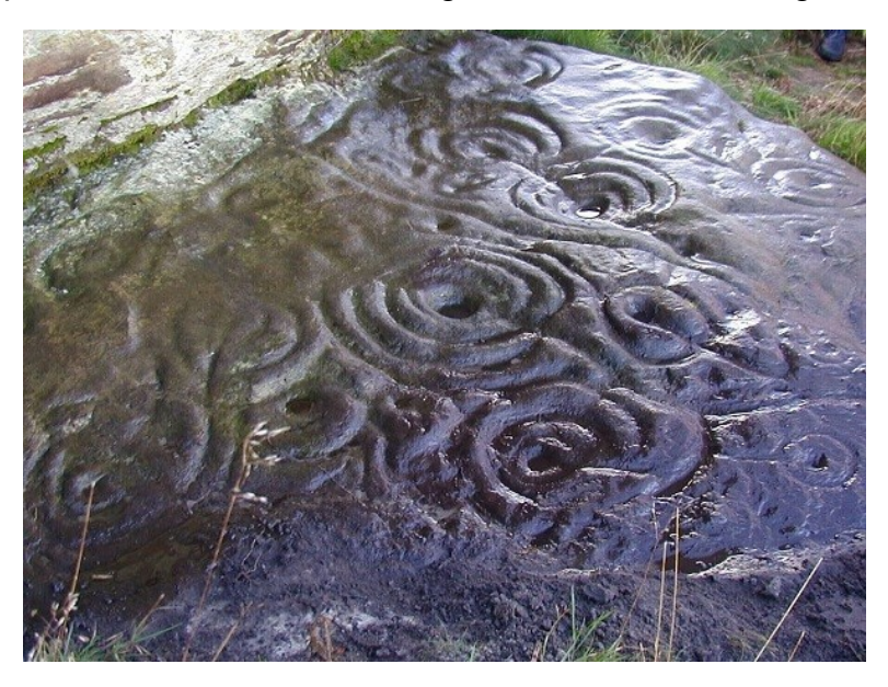
Figure 4 Ketley Crag

Although it is not possible to state categorically that rock art and burials in these cases were made at the same time, it does mean that the places chosen for both were significant points in the landscape. This occurs, too, with burial mounds that are built on other decorated outcrop rocks. More excavation might add to our knowledge.