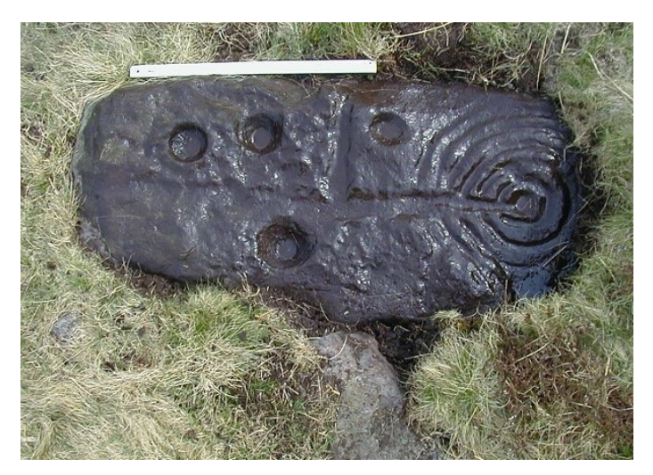
Figure 6 Beanley Moor

The database for Britain is increasing at a satisfying pace, with new areas of the north being investigated. A major part of West Yorkshire is soon to be published, and the North Yorkshire Moors are revealing more rock art. We are also moving towards a more standardised policy for recording, examining the threats to rock art and considering how it should be displayed. To one who has spent many years enjoying the search, that is a great bonus.