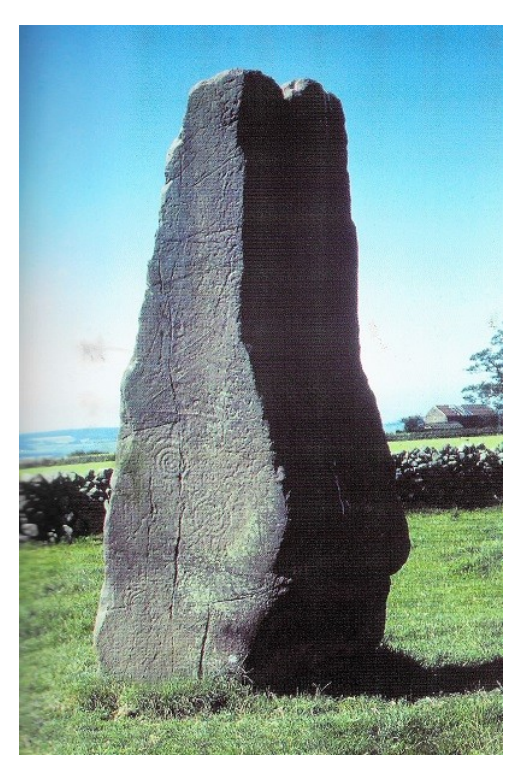
Figure 5 Long Meg

There are many decorated standing stones in Britain, either single, parts of alignments or parts of stone circles. Rock art emphasises the importance of a particular part of a monument.