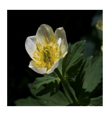
By Benjamin Hurlock