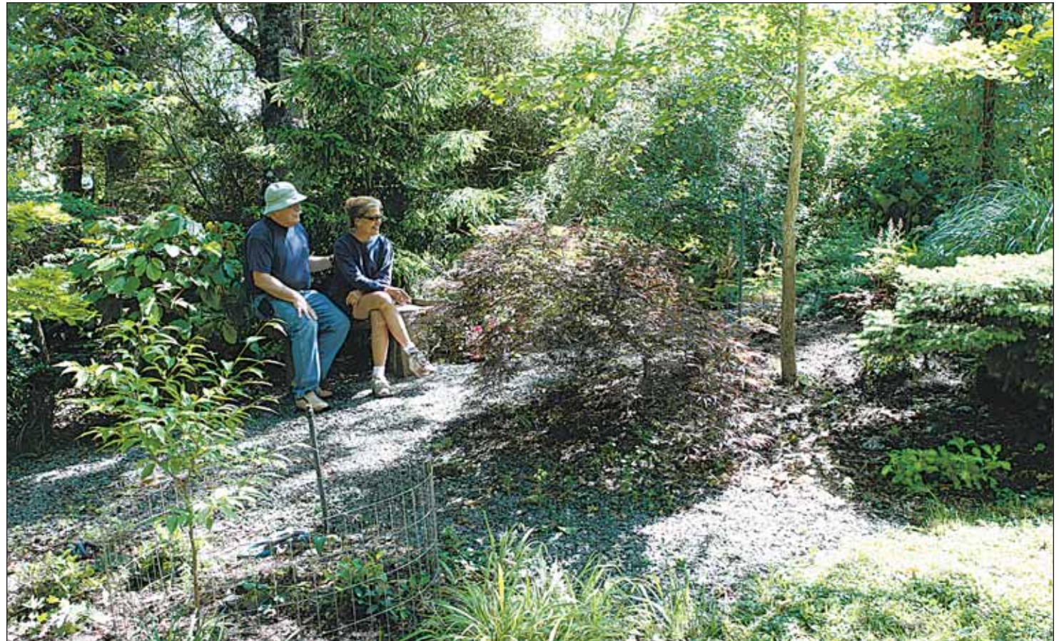
At right, the couple take a rare moment to sit on their garden bench.