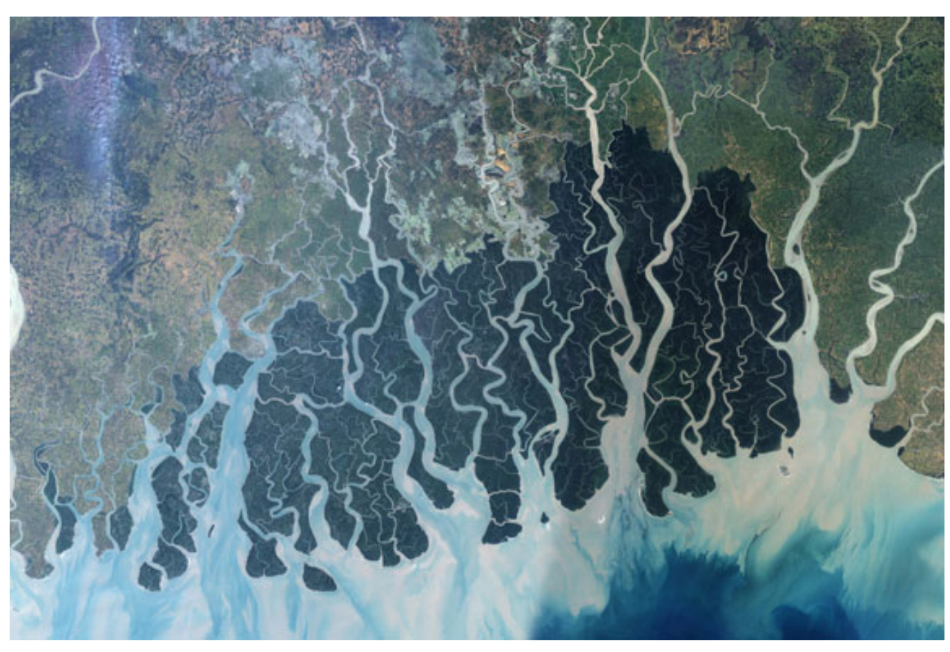
Landsat 7 image of Sundarbans, released by NASA Earth Observatory.