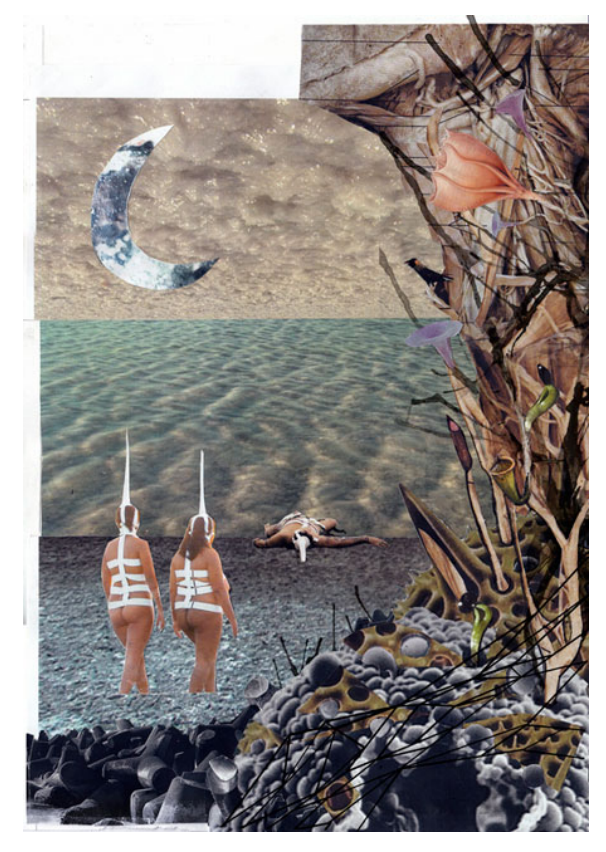
Tejal Shah, Between the Waves – Inner, 2012, mixed media on paper, digital print.

This essay was composed within the framework of the ongoing research project "Landings," and a forthcoming exhibition, to be held as part of the program "The World