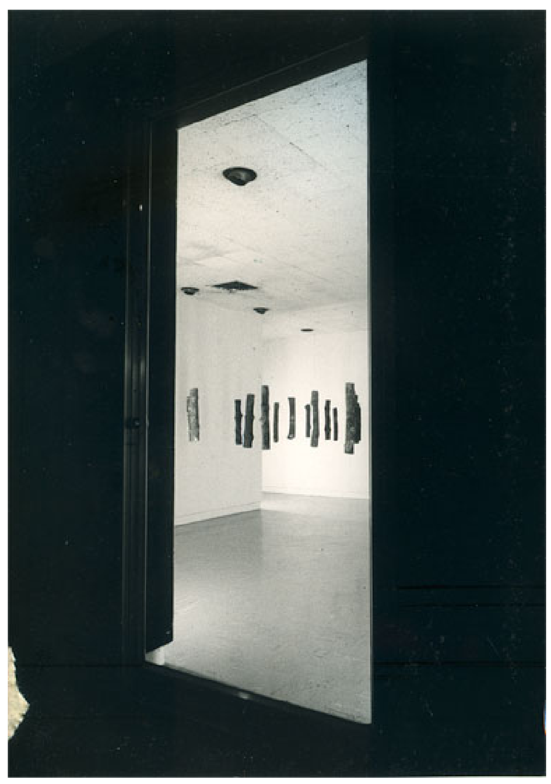
Roberto Chabet, "Bakawan" (Exhibition View), 1974, Bakawan wood, nylon strings, hooks, fluorescent lights, dimensions variable. Acknowledgment to the artist and The Chabet Archive at Asia Art Archive for making the material accessible.