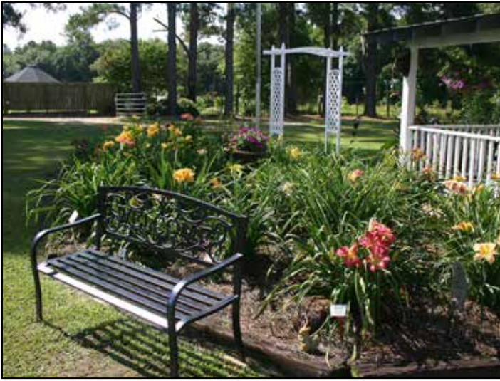
In front of a large air-conditioned sales building complete with kitchen and meeting area, the Douglasses have planted a second display area.