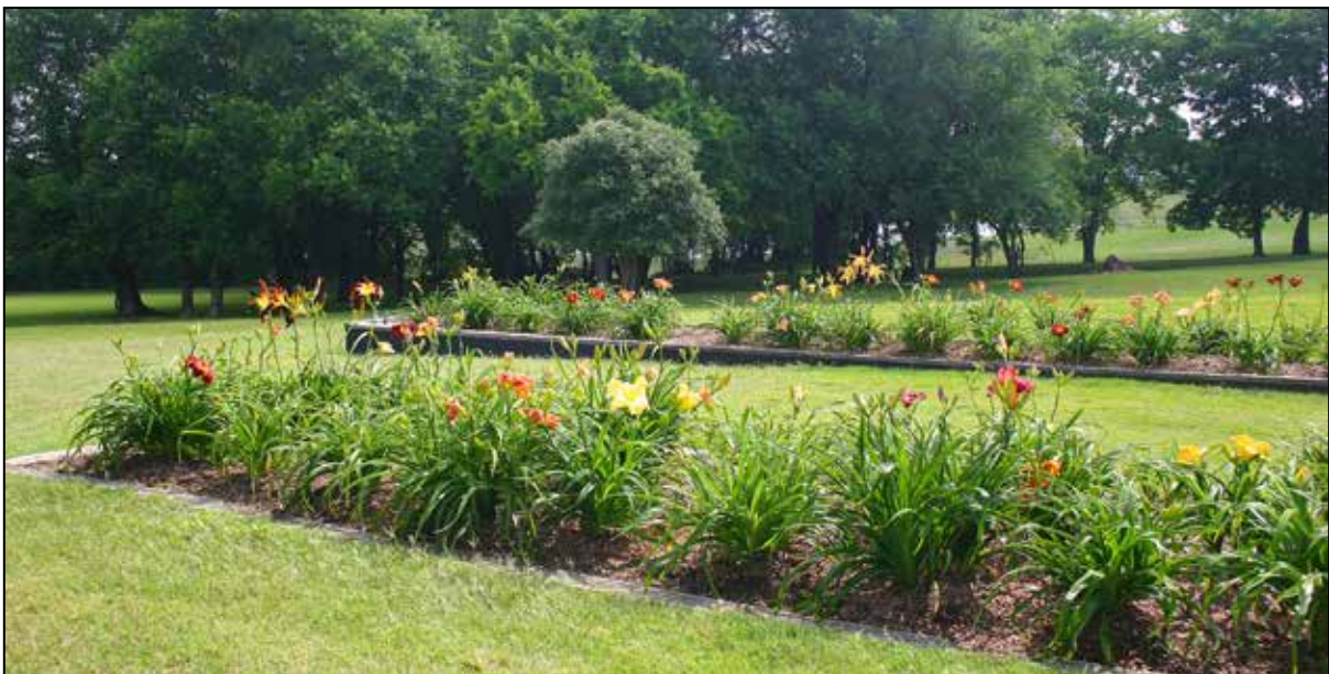
The 2018 Sally Lake Memorial Award Bed in the Carleton Garden