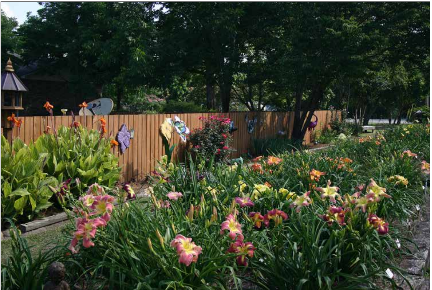
A large display bed, flanked by a wood fence decorated with garden art, runs the length of the front garden. Orange cannas and Knockout roses provide additional interest.