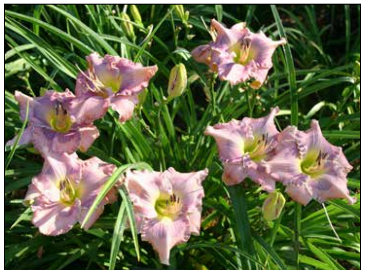
A well-grown clump of H. ‘Orchid Elegance’ (Carpenter-J. 2004) proved to be very photogenic at Canterbury Gardens.