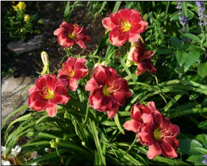
H. 'Walter Kennedy' (Stamile 2008)

of H. 'Rachel Billingslea' (Billingslea, 1990) was a quiet counterpoint to the brighter and darker colors. It is a light rose peach with a somewhat darker halo and yellow to green throat. This round, ruffled beauty proved even older introductions can attract the attention of visitors.