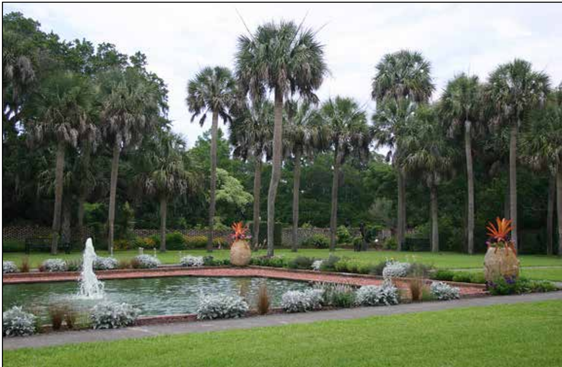
Palmetto Garden