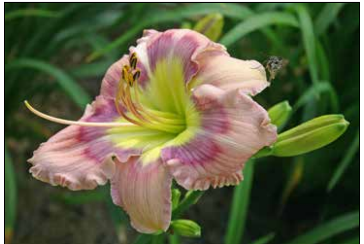
H. 'Butterfly Moon' (Bell-T. 2010)