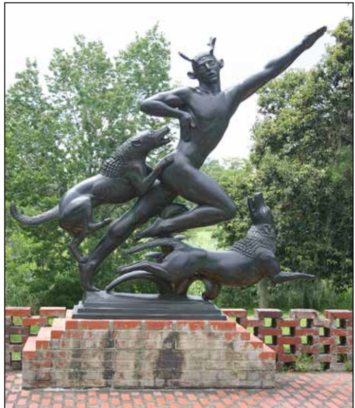
Sculptures featuring Greek motifs were much in evidence throughout the Brookgreen Gardens. Diana, Goddess of the Hunt, was a frequent subject, as in the case of these two companion pieces. On the right the youthful Acteon is being turned into a stag and is being torn by his hounds after having looked upon Diana in the nude (Paul Howard Manship, 1885-1966).

Indeed, there was much nudity displayed throughout the Gardens, but all of it tastefully executed. The gold-clad centerpiece of Dionysus and the panther was beautiful. The Diana Pool featuring the Goddess of the Chase with drawn bow was elegant. The sculpture of Pegasus being tamed by Bellerophon was the largest in size.