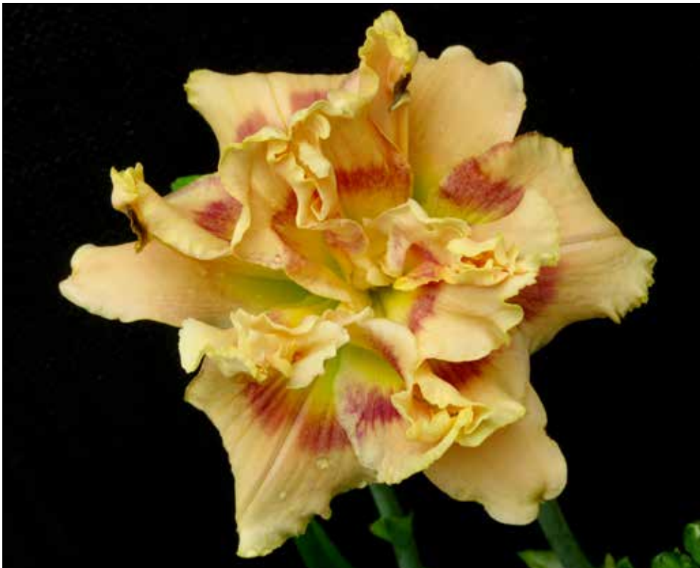
Second Place, Single Bloom Category: Kay Cline H. 'Early Early Truffle' (Kirchhoff-D. 2004)