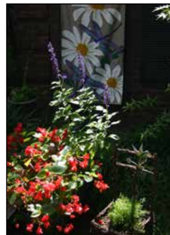
One example of the intriguing garden art at Picnic Hill