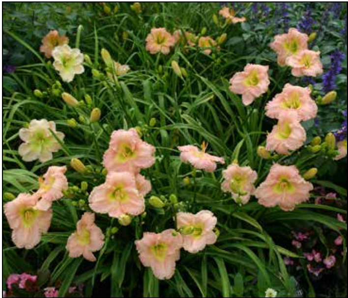
H. ‘Rachel Billingslea’ (Billingslea 1990)