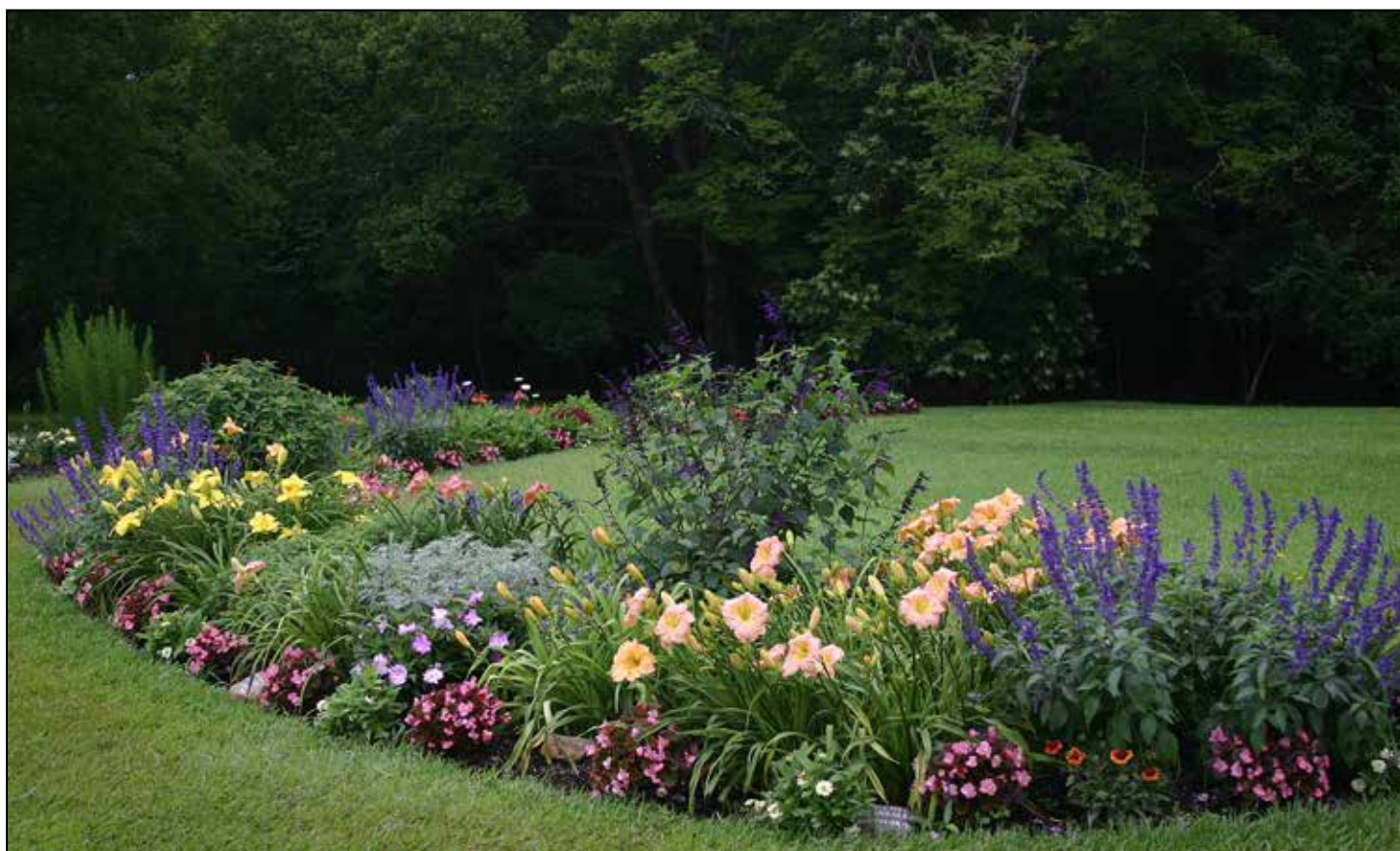
The Billingslea Garden featured not only daylilies, but various companion plants. One long bed was bordered with 'Gin' begonias and 'Profusion Double White' zinnias. The warm colors of the daylilies were complemented with blue 'Mystic Spires Blue' salvia, the taller purple 'Amistad' salvia, and single specimens of a lavender sun patiens and a silvery green artemisia. Hummingbirds love the 'Amistad' salvia.

One special feature of this garden is the use of smooth river rocks as plant markers. The name of each daylily is carefully lettered on the rocks in white paint. These markers are a unique way to make the markers as unobtrusive as possible while still being easy to read.