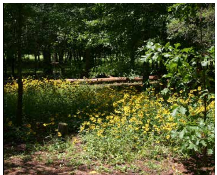
Black-eyed Susans growing wild along the wooded drive