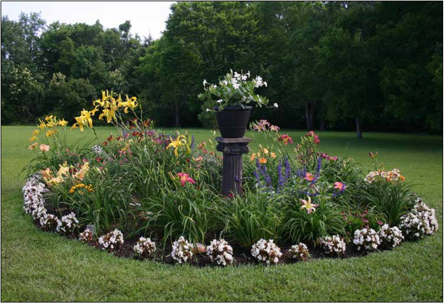
A new pedestal bed established in 2016 especially for the upcoming Regional Meeting was bordered by ‘Whiskey’ begonias. It contained a number of daylily clumps, including the President’s Cup winner, H. ‘Tidewater Elf’, and the impressively tall ‘Banana Smoothie’.

2016 registration ‘Blue Eyes and Big Smiles’ was a small white with lavender purple eye.