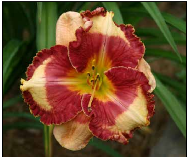
H. 'Too Hot to Touch' (Harry-P. 2013)