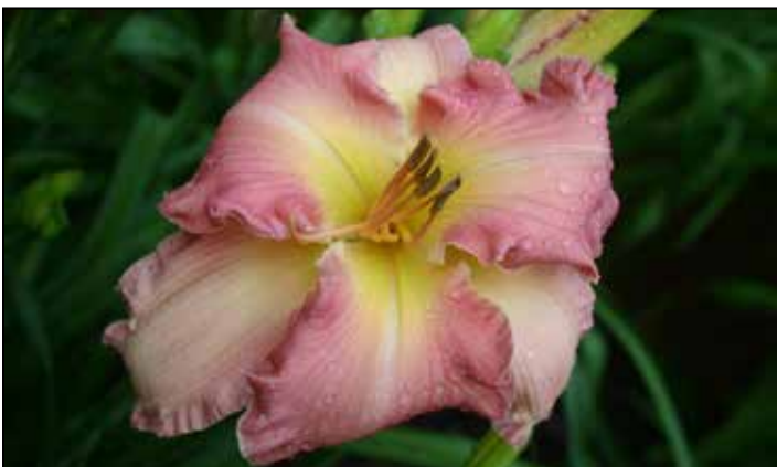
H. ‘Heck of a Dip’ (Zahler 2016)