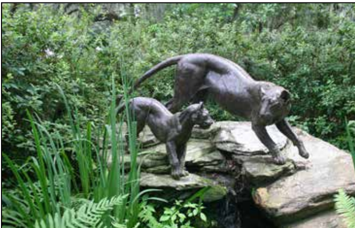
Innumerable smaller sculptures are placed throughout the garden, enhanced by beautiful settings.