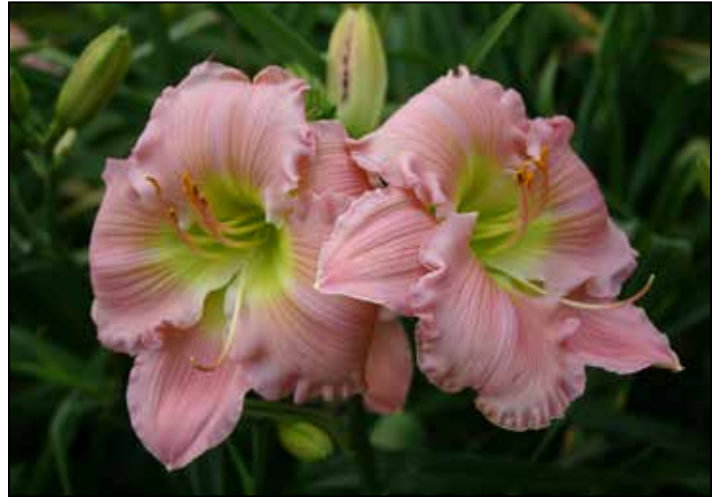
H. ‘Splendiperos in Pink’ (Zahler 2018)