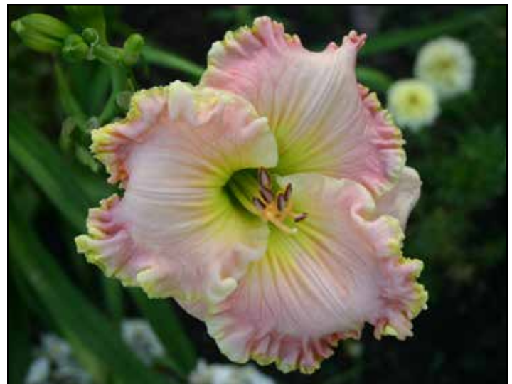
H. 'Memphis' (Trimmer 2008)