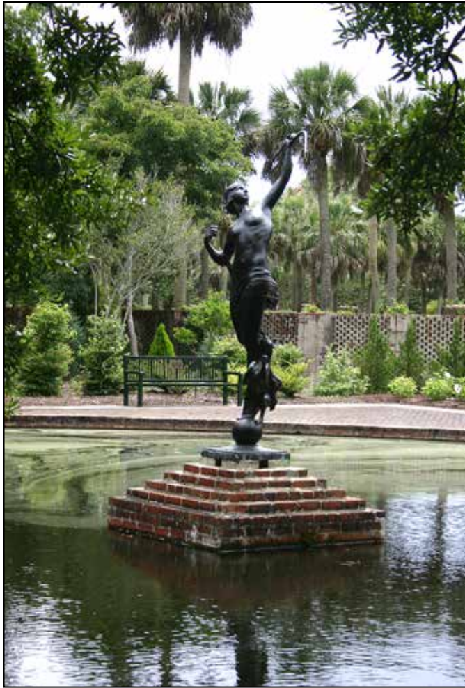
Diana of the Chase (Anna Hyatt Huntington, 1876-1973)