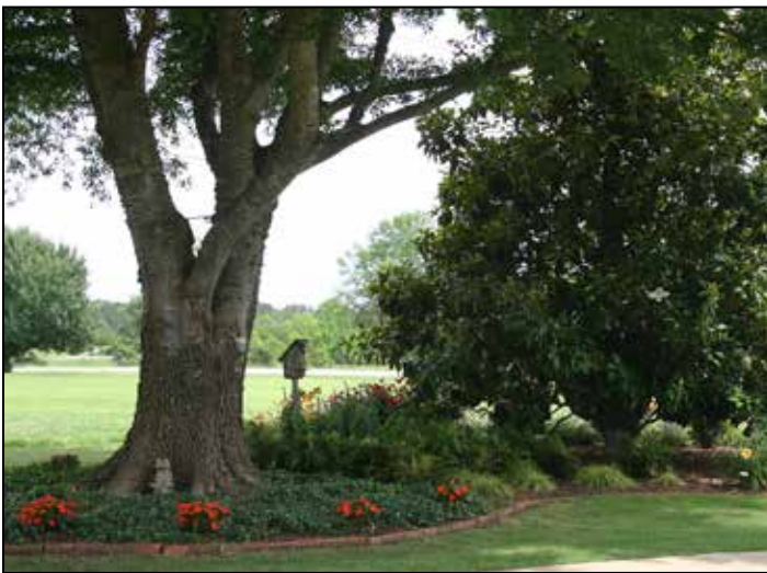
A shady area contains a birdhouse and is bordered by red sun patiens.

Yard art encouraged visitors to observe the gardens at a closer perspective and provided interesting venues. Various planters, iron figurines, a large metal flower, benches, and several urns were purchased from different shopping trips. Some of Linda's special items in the gardens are things she created in ceramics class. The prized birdhouse constructed by MADS member Arthur Woods will last because it is made of cedar. It has attracted a pair of birds who are currently nesting and egg sitting.