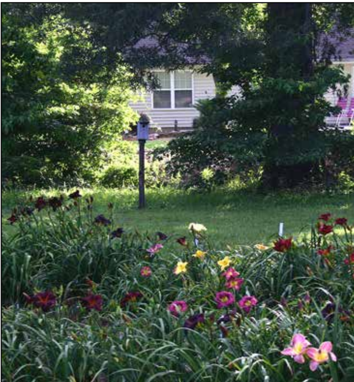
Albers Garden landscape