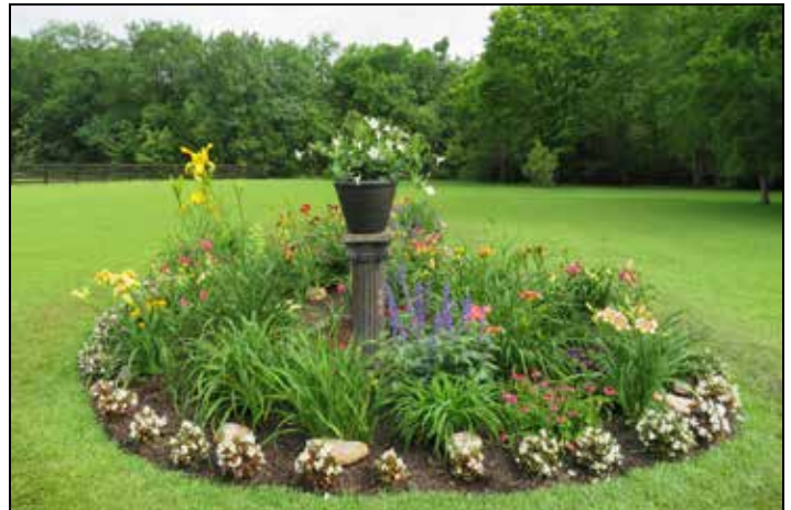
Second Place, Landscape Category: Beverly Odom Billingslea Garden, Montgomery, AL