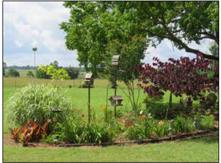
Among the many birdhouses and feeders at Picnic Hill