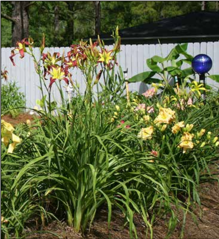
A beautiful display with garden art