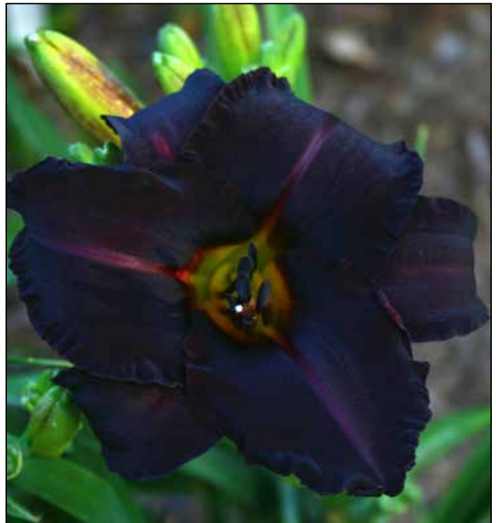
# T-07-197 (Albers Seedling)