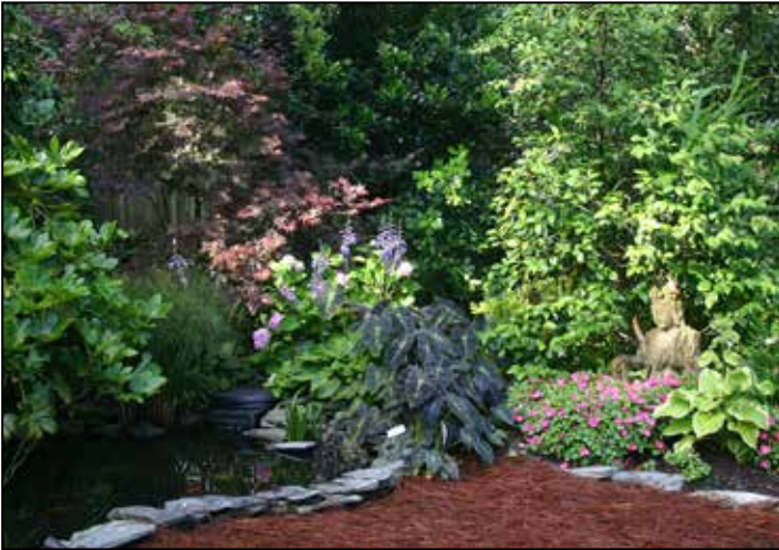
A koi pool and waterfall in an Asian setting