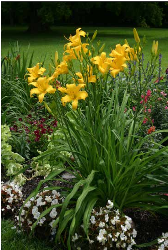
A lovely clump of H. 'Tidewater Elf' garnered the President's Cup.