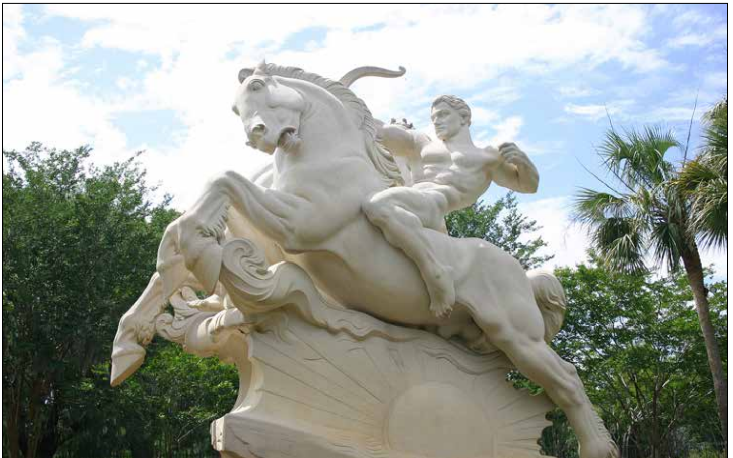
Riders of the Dawn (Adolph Alexander Weinman, 1870-1952), "The Archer Huntsman Astride his Stallion"