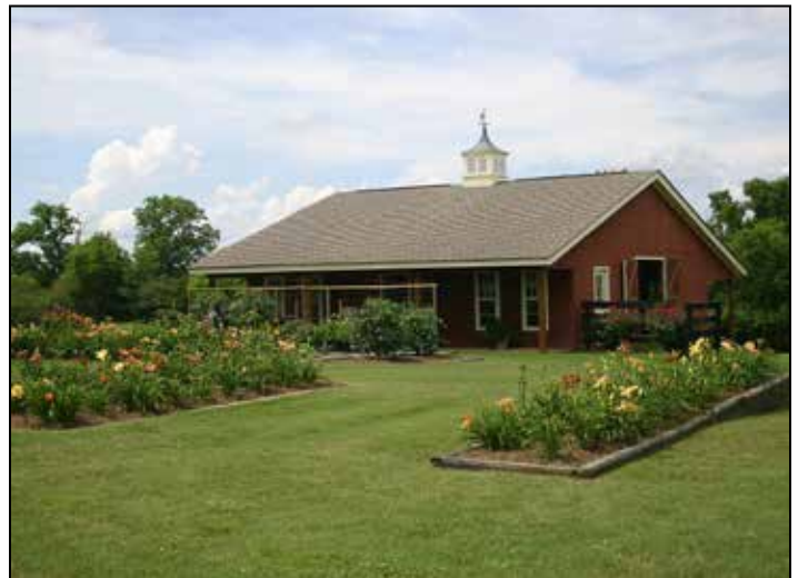
The newly installed Sally Lake Memorial Bed featured daylilies at their best.

throat. Seedling number 16 displayed huge red blooms with big yellow ruffled edges and a yellow throat. Seedling number 33 had very impressive blooms on tour day; it was of a medium rose color, with white ribbing and a yellow ruffled edge with a big yellow throat. Prior to building the SLMAB, George had to consider the clay soil, the installing of underground soaker hoses, and placement of timbers on a sloped area. The existing daylilies growing in that area were to be dug and moved to a different location. To build the new SLMAB, George constructed raised beds with timbered sides, followed by a truckload of super soil placed over chicken manure.