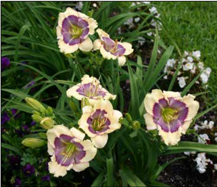
H. ‘Blue Eyes and Big Smiles’ (Falck 2016)

Oliver’s own introductions were interspersed among those of many other hybridizers. A large planting