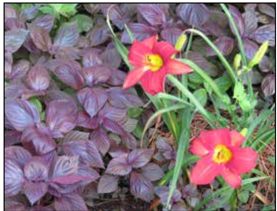
H. 'Roll Tide' (Webster 1987) with purple perilla

As a master gardener, Terese Goodson has done an exceptional job of combining her daylilies with companion plants such as in the picture in the next column of H. 'Roll Tide' with a nice clump of purple perilla.