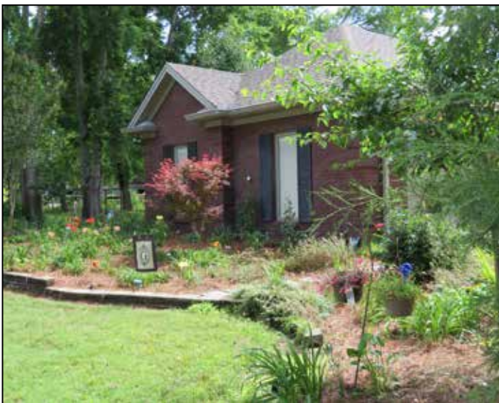
The bed in front of the house featuring daylilies and a Japanese maple

Also in the front yard stands a beautiful, mature Vitex tree which commands your attention, because as we all know, blue is the one color elusive to daylilies. It is a beautiful focal point.