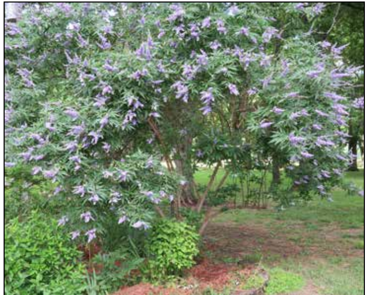
The Vitex tree