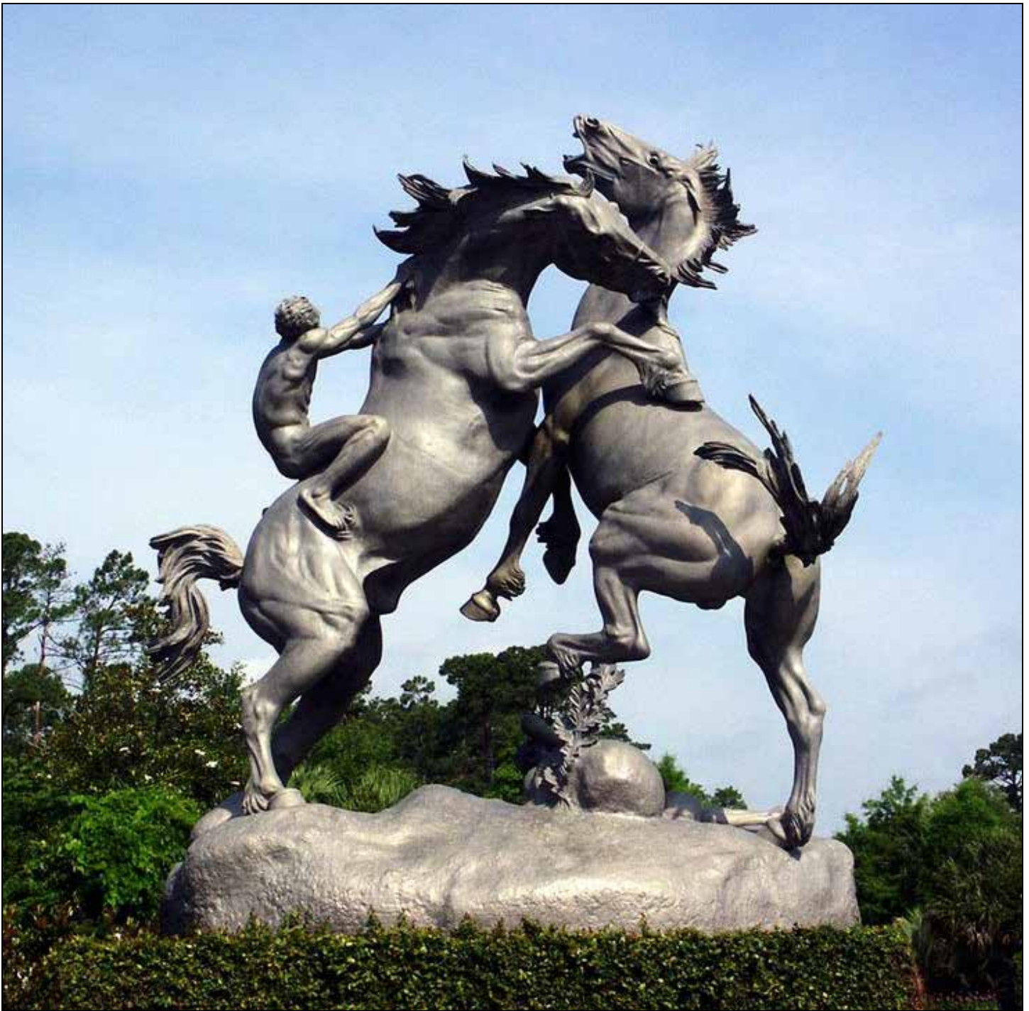
Anna Hyatt Huntington's "Fighting Stallions" at the entrance to Brookgreen Gardens

Anna Hyatt Huntington (1876-1973) was one of the great American sculptors of horses and animals. Her most famous sculptures include the equestrian statue of "Joan of Arc" (1910), located on Riverside Drive at 93rd Street, New York; "Fighting Stallions" (1950), located at Brookgreen Gardens, SC; and "The Torch Bearers" (1955) at Ciudad Universitaria, Madrid.