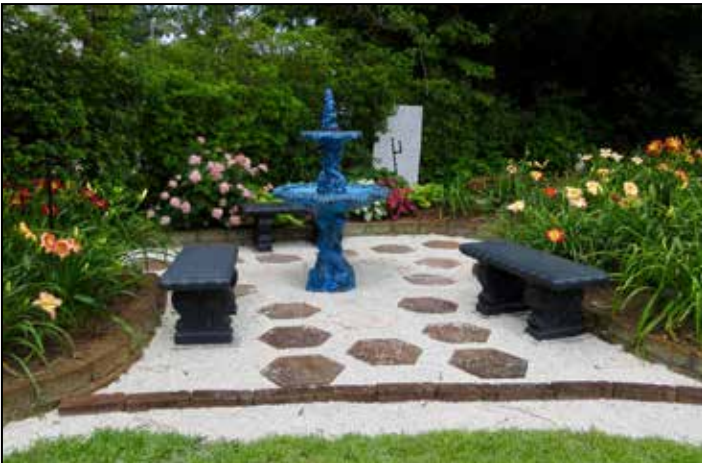
First Place, Landscape Category: Kay Cline Canterbury Garden, Myrtle Beach, SC