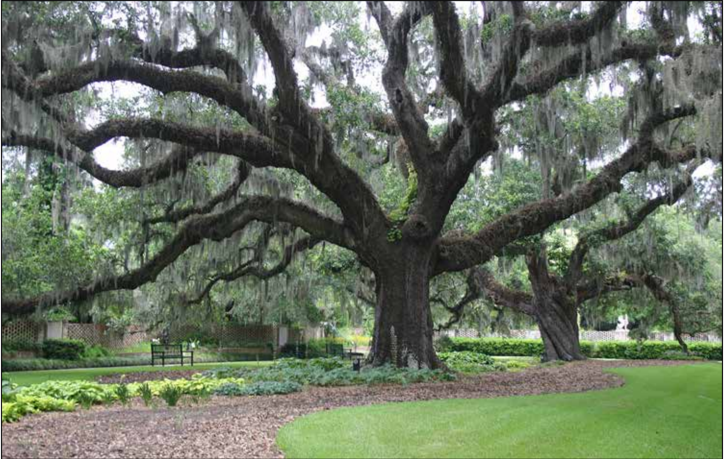
It boggles the mind to think that these trees in Live Oak Allée were planted before the colonies achieved their independence from the British, at a time when the area consisted of four thriving rice plantations.

area consisted largely of rice plantations. The total property consists of 9,127 acres, including waterways and woods. According to one source, the collection of sculptures is one of the largest and most comprehensive in the country. Of special interest to Convention attendees was the Daylily Walk, containing a number of plants hybridized by members of the Georgetown Area Daylily Club.