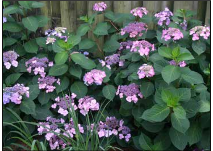
A beautiful lace-cap hydrangea in full bloom