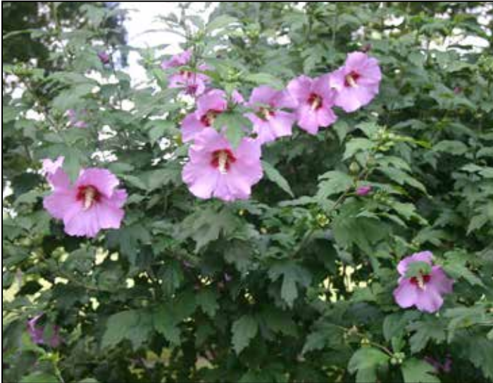
One of the many beautiful shrubs at Picnic Hill: a rosy-lavender althea

As you make your way along the side of the house, you are delighted once again with a long, generous bed of daylilies and companion plants.