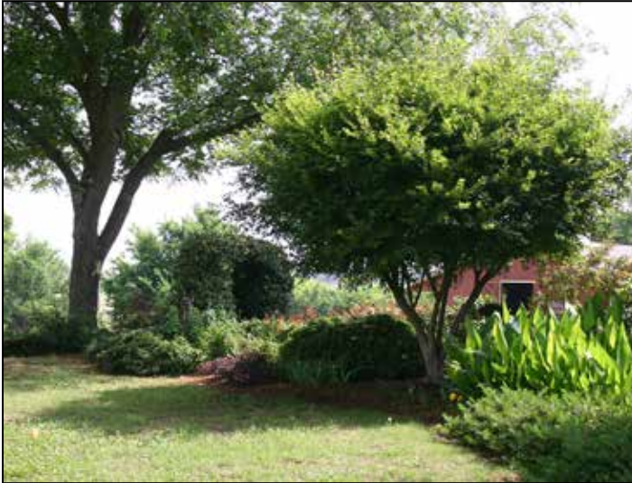
A beautiful side yard features canna lilies alongside holly fern and irises.

iris, and canna lilies all dispersed with more daylilies, wherever enough sunlight is possible.