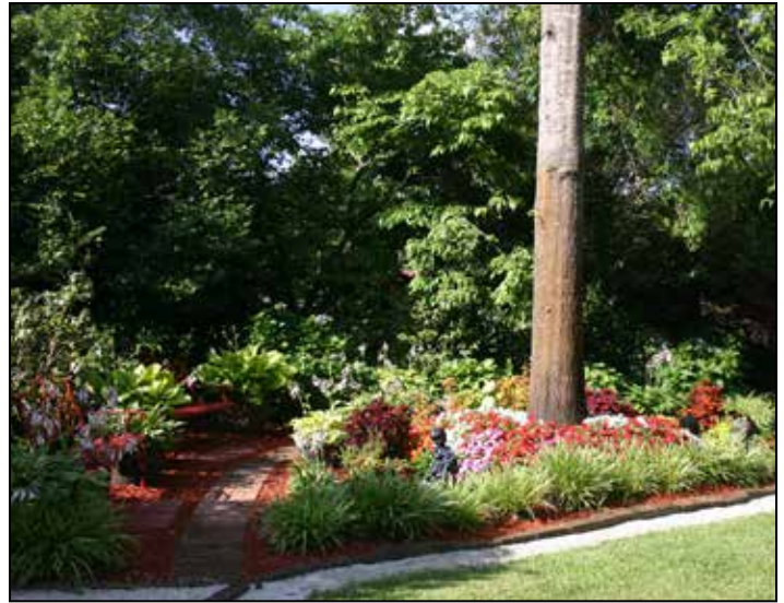
H. 'Expect the Unexpected' (Jeffcoat-P. 2012) shows what can happen when one crosses two fine diploids, 'Lavender Blue Baby' x 'Evelyn Gates'.