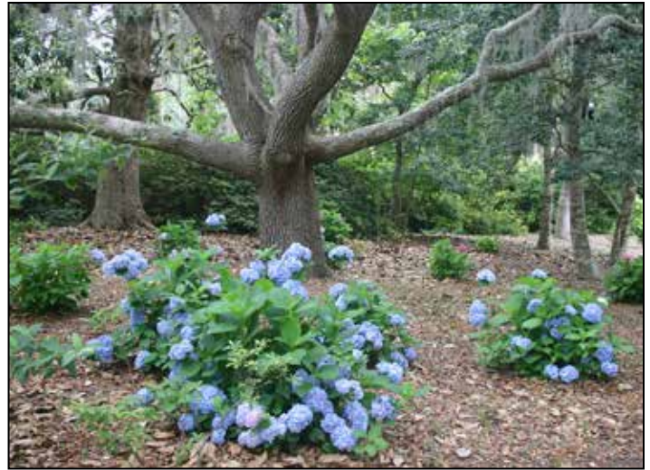
Blue hydrangeas were in full bloom, such as this planting of Hydrangea 'Endless Summer'. Elsewhere there were numerous lace-caps in bloom as well.