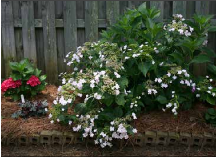
Hydrangea 'Fuji Waterfall'

Among the companion plants in the backyard were hostas, amaryllis, vincas, verbena, gardenias, roses, azaleas