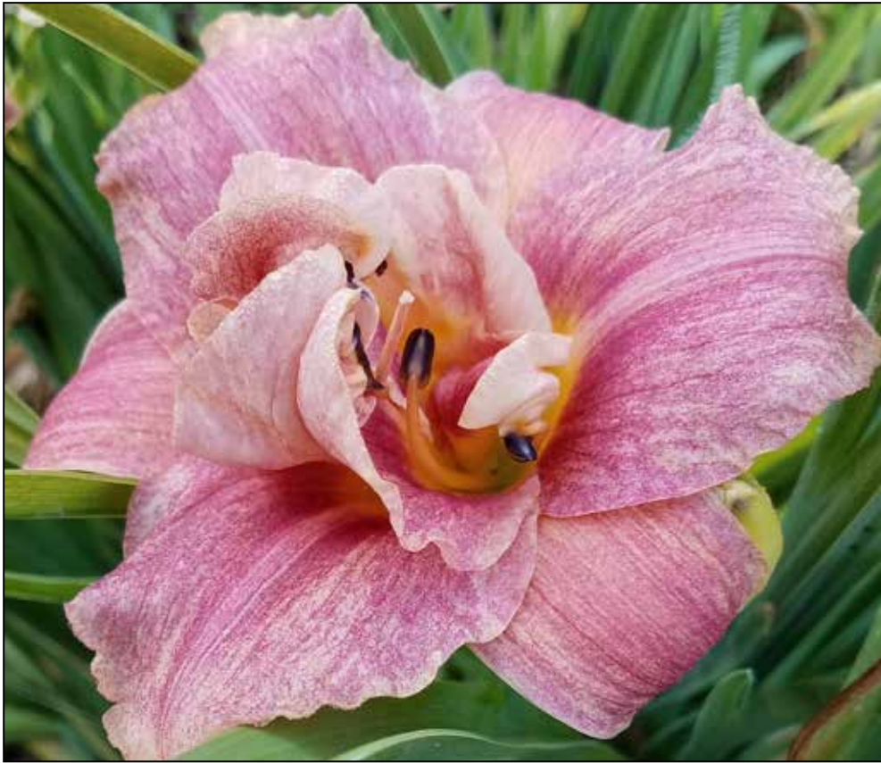
First Place, Single Bloom Category: Hank Immler H. 'Lake Martin Double Streaky Freaky' (Ponder 2015)