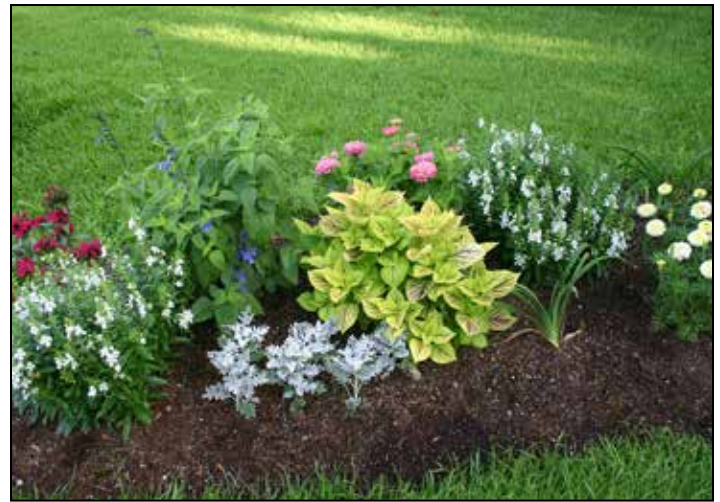
Coleus 'Gay's Delight' with Angelonia 'Archangel White'