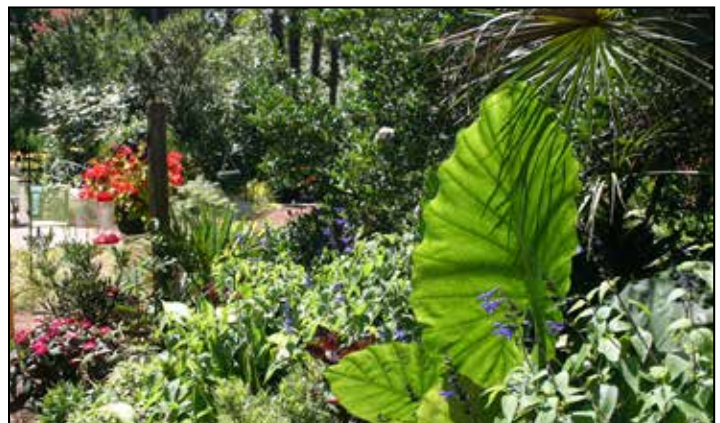
Elephant Ears with Black and Blue Salvia