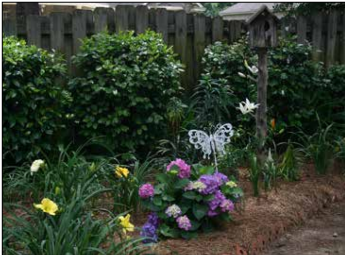
Each venue contributed to the Frye's Garden being selected as the recipient of the Region 14 Landscape Award.

The entire backyard had strategically placed garden art accenting the many daylilies. One bed with a rustic fence serving as a backdrop contained yet another birdhouse and a beautifully sculpted butterfly alongside mophead hydrangeas and yellow daylilies.