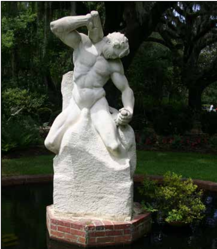
Man Carving His Own Destiny (Albin Polasek, 1879-1965)