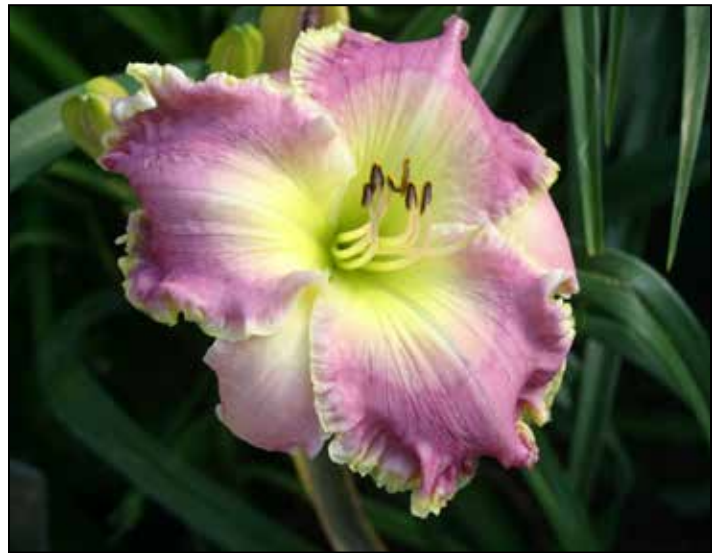
H. ‘Charles Can’t Have It’ (Douglas-H. 2013) illustrates the friendly competition between husband and wife.