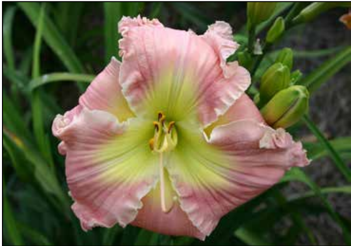
In the main display area, H. ‘Muddy Creek Magic’ (Tanner-G. 2015) was particularly elegant. This pink with a lemon to cream to green throat is a diploid.