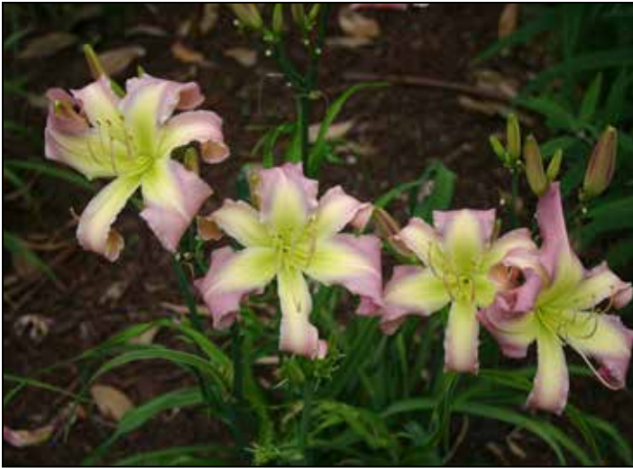
Daylilies were in full bloom along the Daylily Walk, including this lovely display of Hemerocallis 'Breathing in Snowflakes', which was beautiful in several tour gardens.