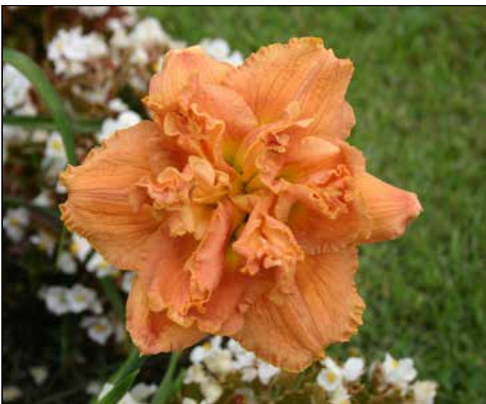
H. 'Jubilee Shrimp Boil' (Falck 2016)