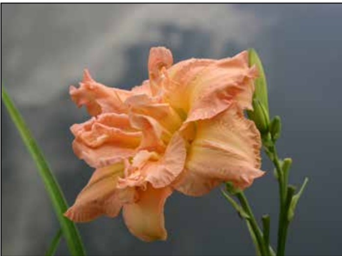
H. ‘ Dublin Elaine ’ (Joiner 1987) provided a pleasing photographic opportunity, its double peach pink bloom caught against the lake water.