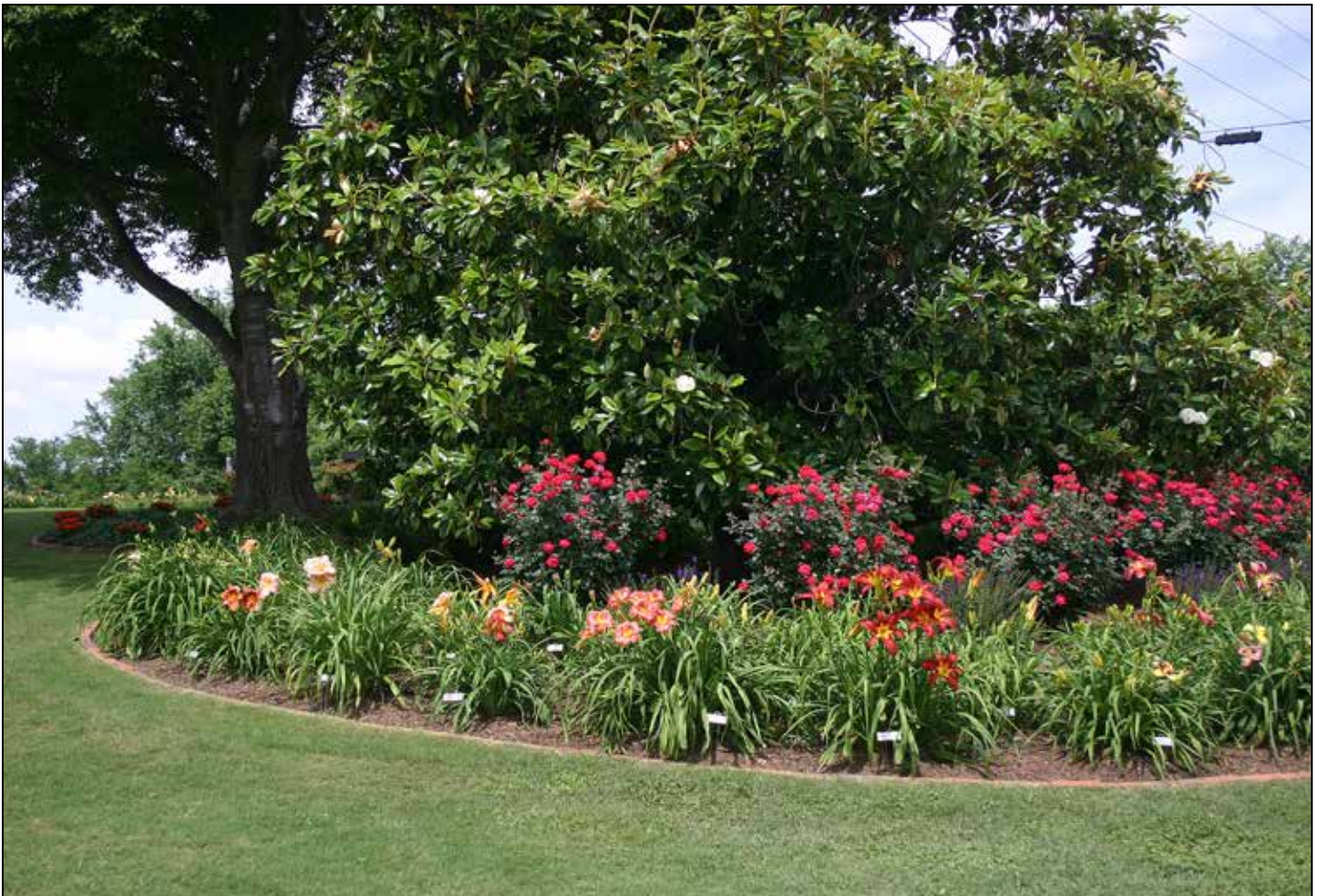
A magnificent magnolia tree serves as a backdrop for one of the many beds featuring daylilies at “Otis Acres.”