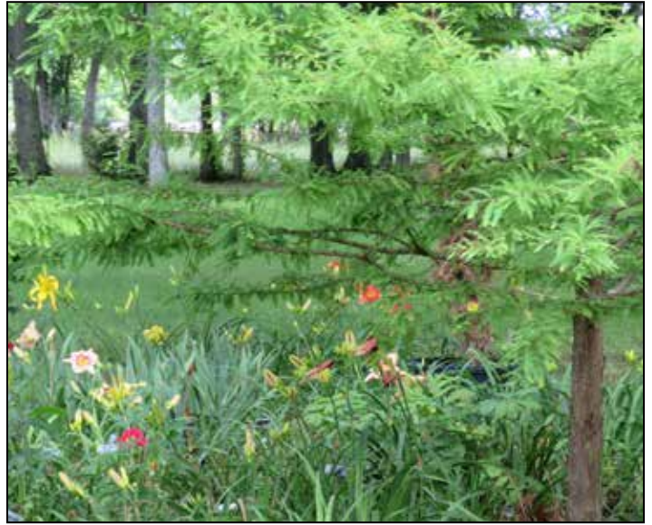
An interesting bald cypress tree amidst the daylilies

Generous beds of daylilies bordered with stone and punctuated with ornamental trees surround the house. The bed in front of the house features a Japanese Maple as a centerpiece to compliment the daylilies.