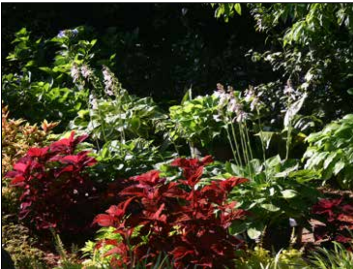
While it is sometimes difficult to photograph daylilies in close proximity, there is often the respite of a partially shaded area filled with hostas and coleus.