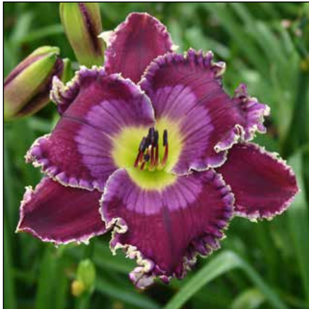
H. 'Song of the Sea' (Emmerich 2018)

Hughes, Diane G. 6043 Woods Road Picayune, MS 39466