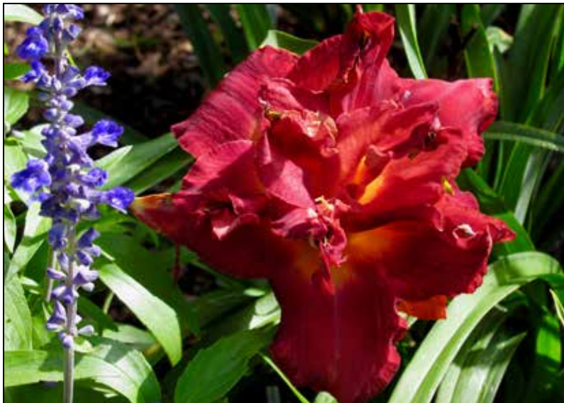
Second Place, Daylilies with Companion Plants Category: Kay Cline H. 'Double Blue Blood' (George-T. 2005) with salvia