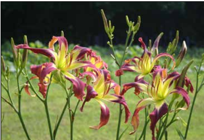
H. 'Jelly Dancer' (Herr-D. 2010)