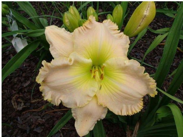
Hemerocallis 'Dallas Legacy' (Hansen-D. 2008)