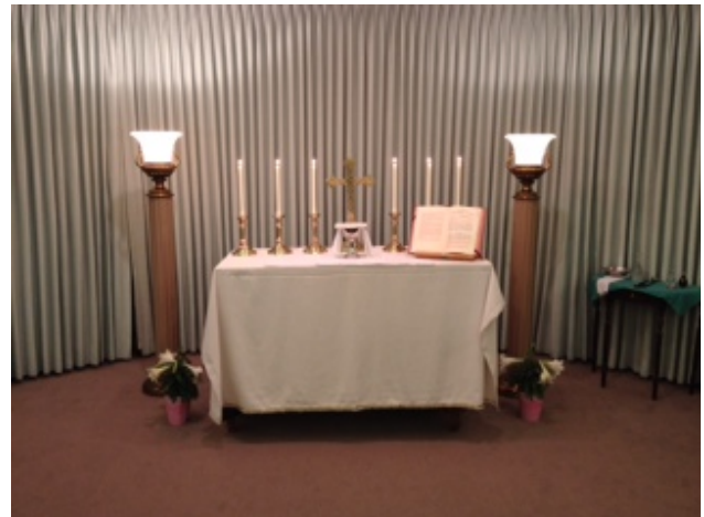
Altar set up for Easter Sunday