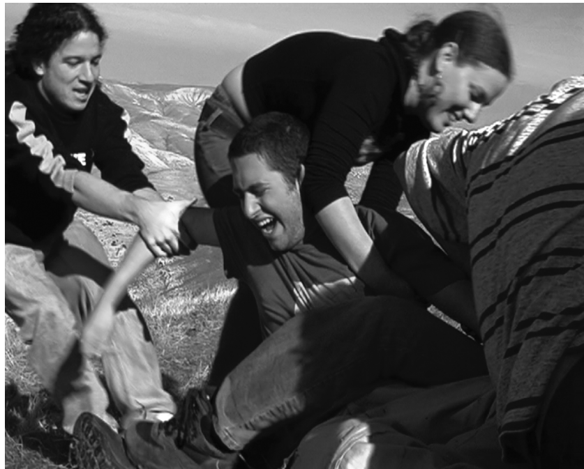
Yael Bartana, Wild Seeds, 2005, single-screen video