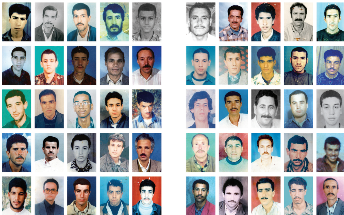
Omar D, Devoir de Mémoire/A Biography of Disappearance , Algeria 1992.

In the present-day, for Agamben, the single most pertinent and emblematic 'zone of indistinction', the space within which 'bare life' is routinely politicised, is Guantánamo Bay, a threshold space where the rule of law has been usurped and the fundamental right to trial and prosecution after arrest has been effectively suspended. 15 It is again a source of fatal irony that the very moment in which the inmates of Guantánamo are left bereft of political community – the very moment in which they are reduced to 'bare life' – is that most politicised of moments. 16 On the occasion of the 51st Venice Biennale in 2005, Christoph Buchel and Gianni Motti staged their 'Guantánamo Initiative' so as to draw attention to the interstitial location of this so-called detention centre and the suspension of legality that brought it into being. Requesting a new lease from the Cuban government for Guantánamo, so as to transform it from