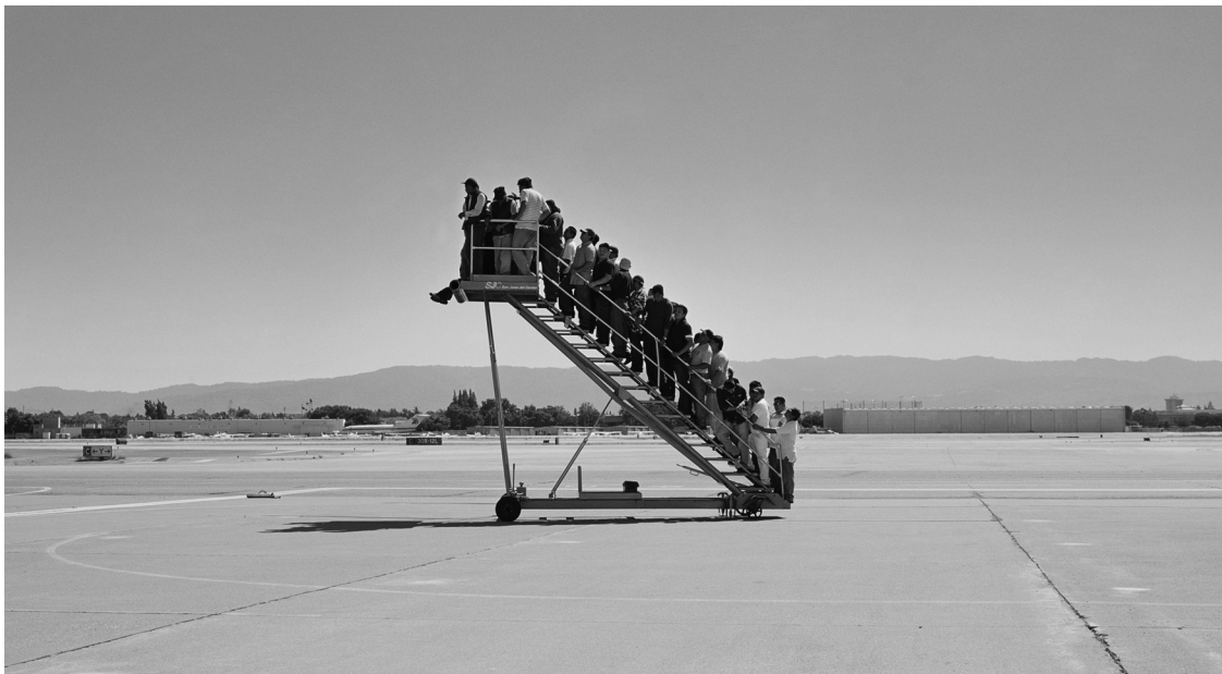
Adrian Paci, Centro di Permanenza Temporanea , ( Centre of Temporary Permanence ), 2007, framed photograph, 105 × 186.5 cm

We return here to the effects of a 'state of exception' and the re-emergence of sovereign power under cover of an executive usurpation of both national and international legislature. Law becomes a law unto itself and yet beyond law too. In the midst of such states of emergency, the citizen is strategically confused with homo sacer so as to further monitor, control, marginalise and, if sovereign-ordained power sees fit, put him/her to death. To our list above we could add the countless political prisoners languishing in cells the world over, from modern-day Russia to the emerging superpower that is China. We could also note, somewhat nearer to home, how the policy of internment without trial initiated in Northern Ireland in the 1970s, under the Civil Authorities (Special Powers) Act, introduced a law giving the authorities the power to detain suspected terrorists without trial. One of the more notable events to emerge in Northern Ireland following on from this period was the so-called 'Hunger Strikes' in 1981 during which ten men starved