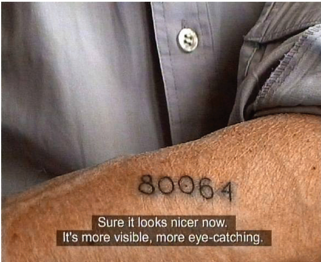
Artur Żmijewski, 80064 , 2004, single channel video, 11 min, courtesy of the artist and Galerie Peter Kilchmann, Zurich

... it is implicit in many testimonies that at Auschwitz everyone somehow set their human dignity aside... The survivor is therefore familiar with the common necessity of degradation; he knows that humanity and responsibility are something that the deportee had to abandon when entering the camp. 14