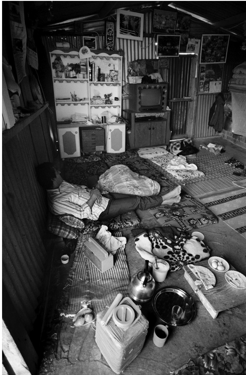
Ahlam Shibli, Awakening , from Unrecognised series, Arab al-N'aim, Palestine, 2000, 60 × 91 cm, digital print

'A Life Full of Holes', Third Text , 20:82, 2006, pp 617–26.