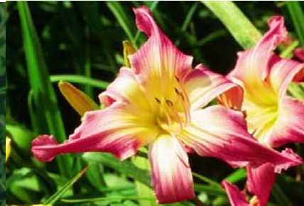
Lake Norman Spider