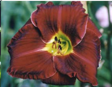
Shades Of Darkness