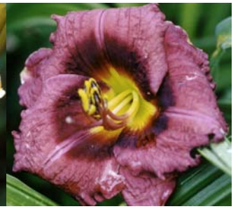
Bibbity Bobbity Boo