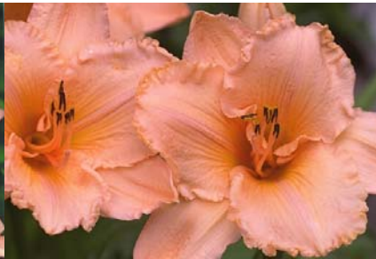
Dance Ballerina Dance