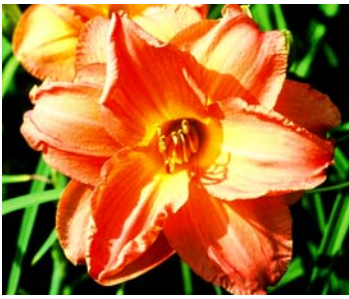
All In All