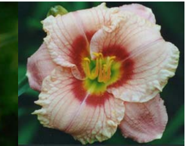
Siloam Bye Lo