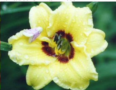
Siloam June Bug