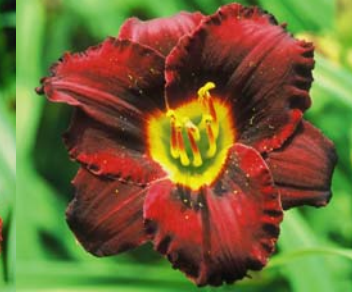
Cinderella's Dark Side