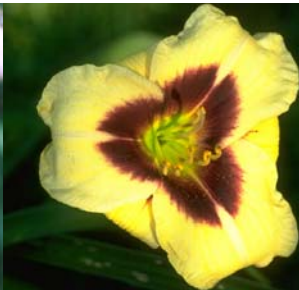
Siloam Button Box