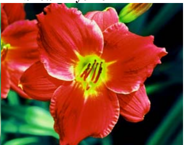
Siloam Red Ruby