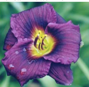
Siloam Plum Tree