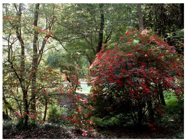
R. prunifolium at Callaway Gardens