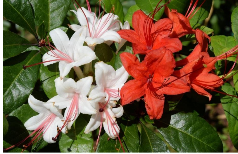
R. arborescens var georgiana with 'Ralf's Best Red'