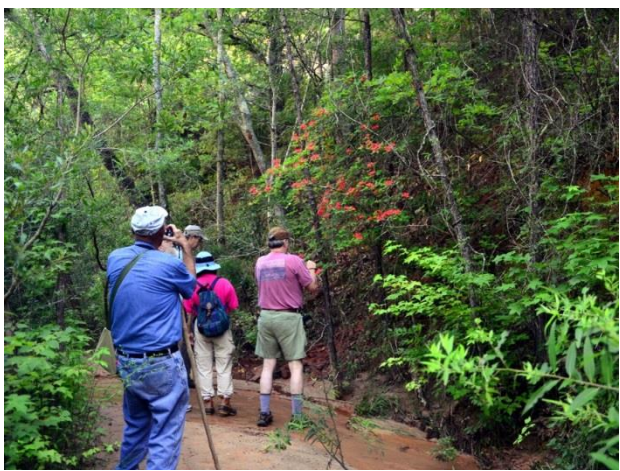
R. prunifolium in the Ravine