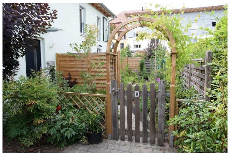
Entrance to Ralf Bauer's Garden

When you buy online, please go the ARS Store first. We get a commission from many online businesses.