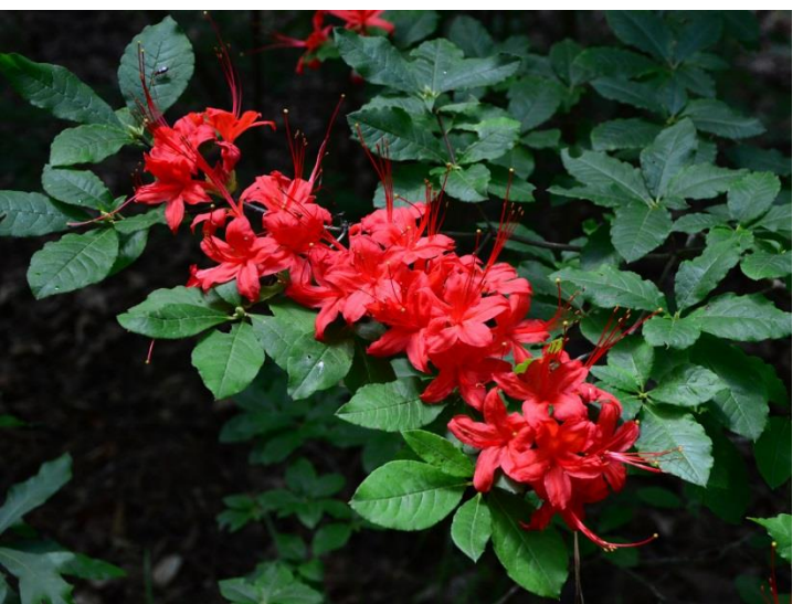
Flowers and Foliage