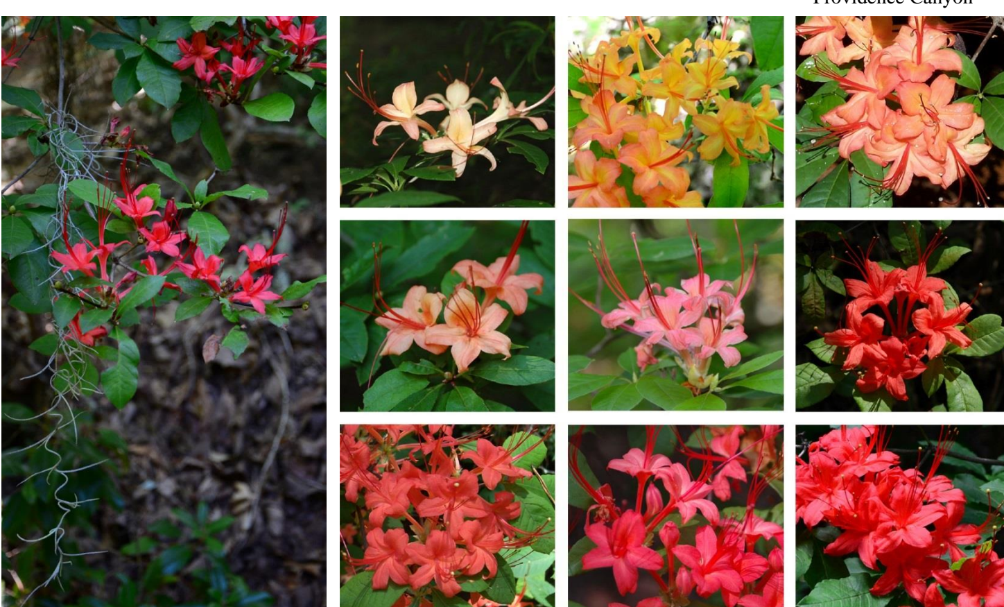
R. prunifolium & Spanish Moss