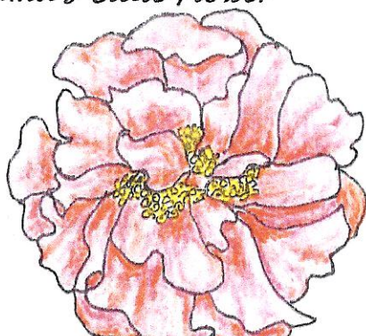
C. reticulata "Elaine"