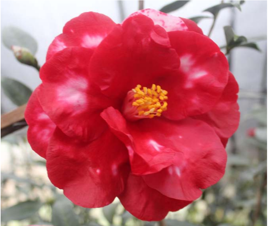
Royal Velvet Var.