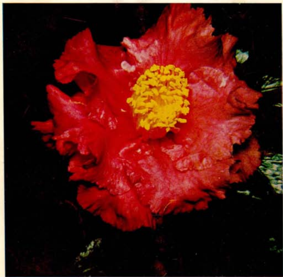
GULLIO NUCCIO FIMBRIATED—ACS Registration 748

Published for the Members of NORTH & SOUTH CAROLINA, GEORGIA and VIRGINIA CAMELLIA SOCIETIES