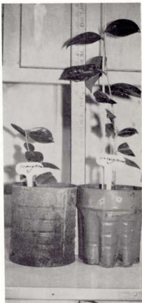
EVIDENCE—Seen above are two grafts of Tomorrow variegated. The one on the left was grafted during an unfavorable sign of the moon. The one on right was grafted during a favorable sign. The understock was Professor Sargents of the same size. The scions came from the same plant.