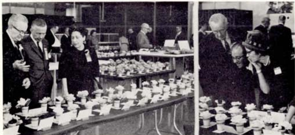
Judges had difficult task in selecting winner at Columbia. There were 235 varieties in the field of 3,200 blooms.