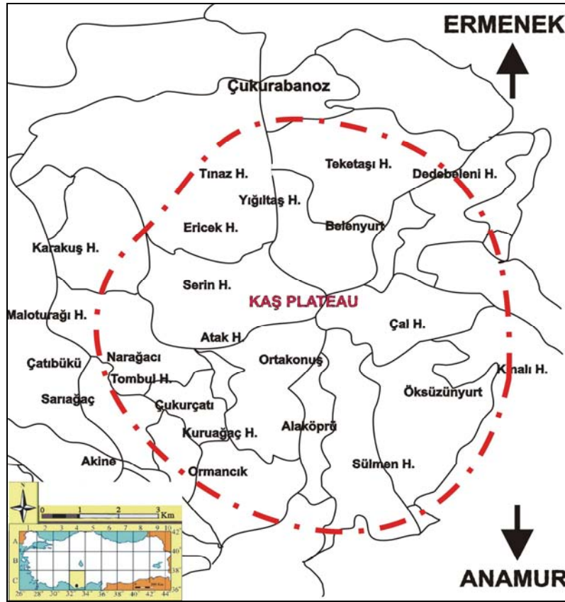
Figure 1. Map of the study area.

al., 2003). The most common soil type in the research area is the red podzolic soil (Doğu Akdeniz havzası toprakları, 1974).