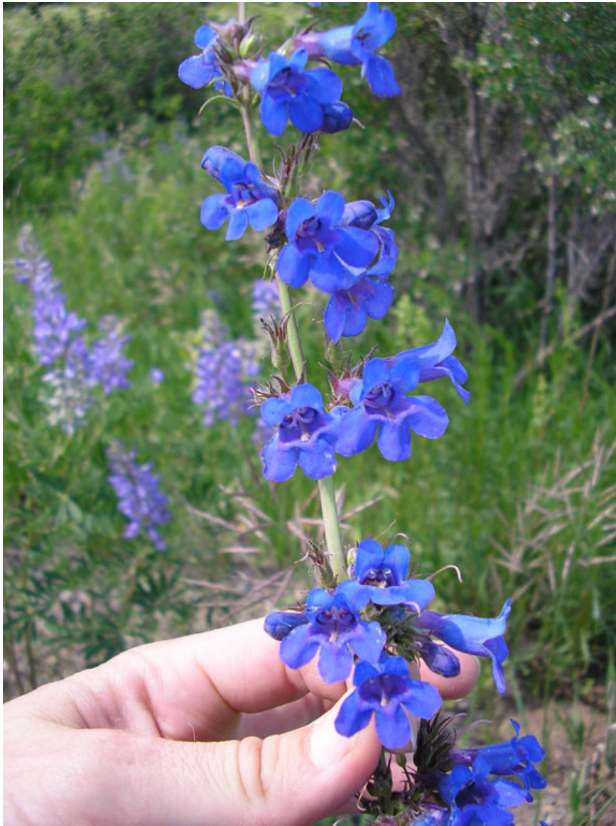
Close up of Penstemon mensarum by Bernadette Kuhn