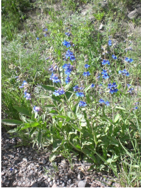
Close up of Penstemon mensarum by Peggy Lyon.