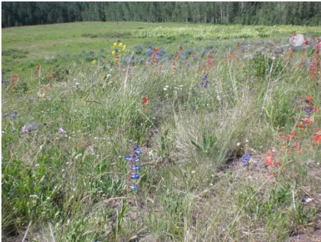
Habitat of Penstemon mensarum