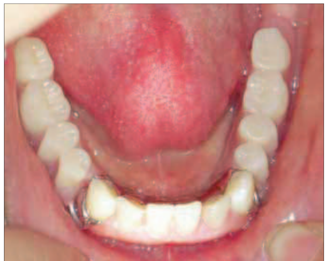
Figure 5 Occlusal view of seated mandibular RPD