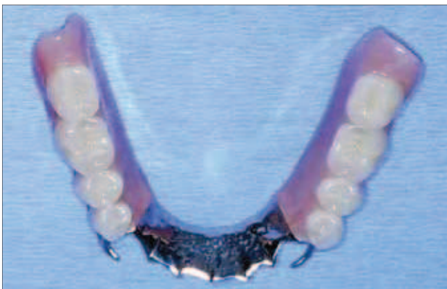
Figure 4 Occlusal view of mandibular RPD