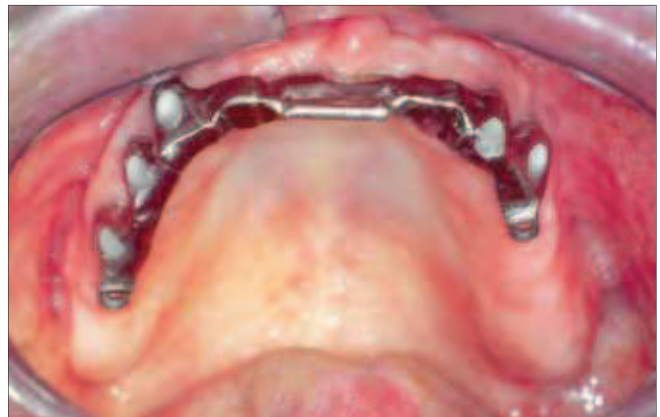
Figure 3 Frontal view of maxilla with splinted bar with ERA attachments