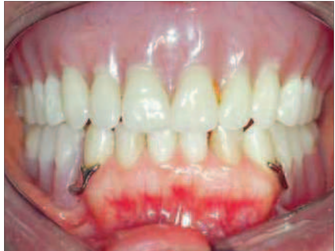
Figure 7 Frontal view of patient in maximum intercuspation while wearing maxillary overdenture and mandibular RPD