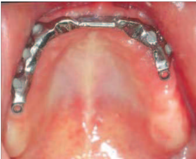
Figure 2 Palatal view of maxilla with splinted bar with ERA attachments

After the fixtures were uncovered and healing abutments were placed, new diagnostic cast were made and custom trays were fabricated for a fixture-level final impression. Wax records were made, the cast was mounted, and wax teeth try in was completed with the patient's approval for processing. During treatment, it was decided to splint the implants together with a gold bar since two fixtures had previously failed, and an open palate overdenture design was selected to restore facial contours and esthetics while allowing better speech. (Figure 2,3) The opposing arch was restored with a conventional distal extension removable partial denture. (Figure 4,5) The case was processed, completed, and delivered to the patient's satisfaction. (Figure 6,7) Only one post-op adjustment was necessary to adjust a sore spot noted on the mandibular prosthesis.