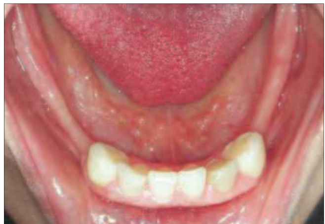
Figure 1 Occlusal view of mandible at initial presentation

The patient presented with a severely resorbed, atrophic edentulous maxilla. The mandible had bilateral edentulous spans, with only #22-27 remaining. ( Figure 1 ) Various treatment plans were discussed with the patient for the maxilla, including a complete denture and the possibility of implants. Since the maxilla was severely resorbed and flat, a maxillary complete denture would have a poor prognosis due