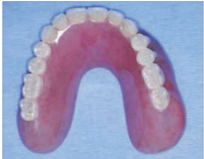
Figure 9 Cameo view of U-shaped palate-less maxillary overdenture

needed. 12 Thus a splinted design was utilized to maximize retention given that the implants were placed in grafted tissue and a palateless design was chosen to maximize patient comfort. (Figure 9,10) A milled bar was utilized because