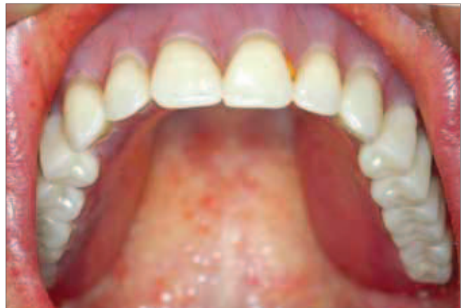
Figure 10 Palatal reflection of seated maxillary overdenture