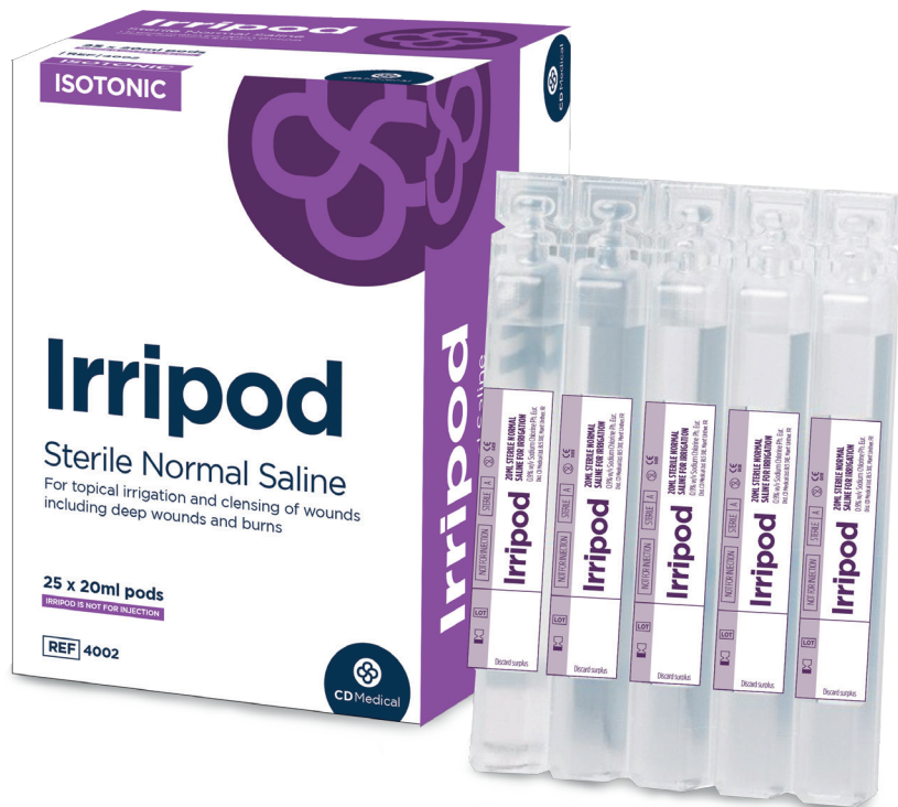
Irripod Saline Pods