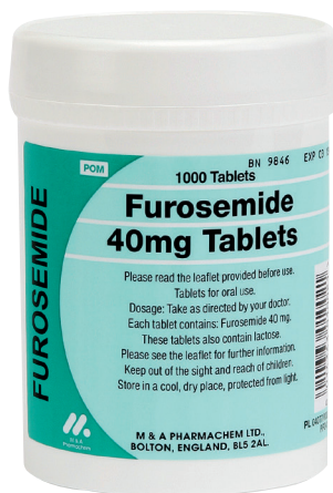
Furosemide 40mg Tablets Pot