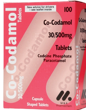
Co Codamol 30/500mg caplets blister