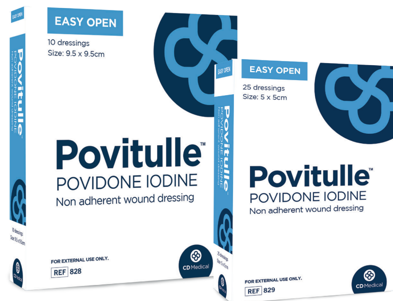
Povitulle Wound Dressing