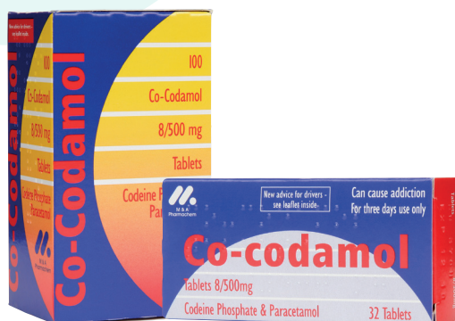
Co-Codamol 8/500mg Tablets Blister