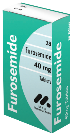
Furosemide 40mg Tablets