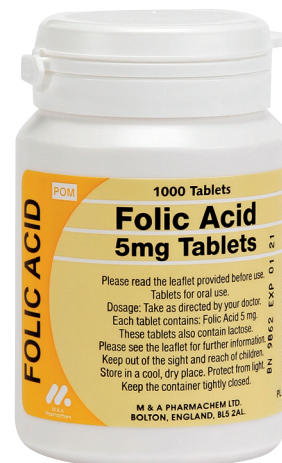
Folic Acid 5mg Tablets Pot