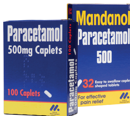
Paracetamol 500mg Tablets Caplets