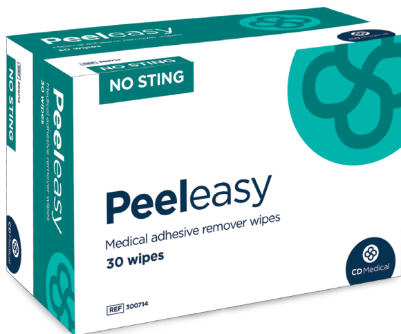
Peeleasy Spray and Wipes