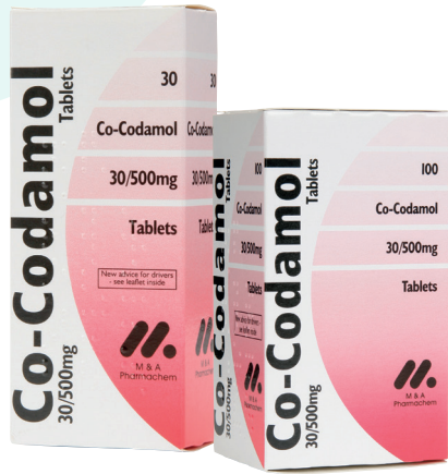
Co-Codamol 30/500mg Tablets Blister