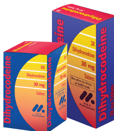
Dihydrocodeine 30mg Tablets