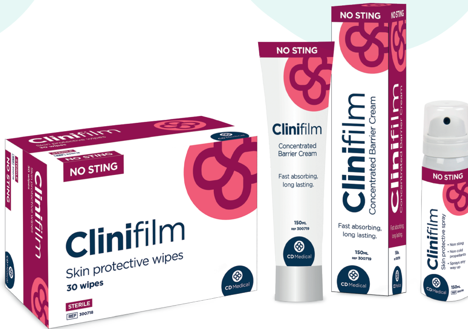
Clinifilm Spray, Cream and Wipes