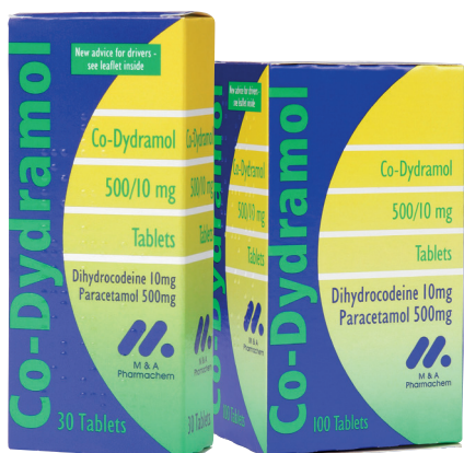
Co-Dydramol 10/500mg Tablets Blister