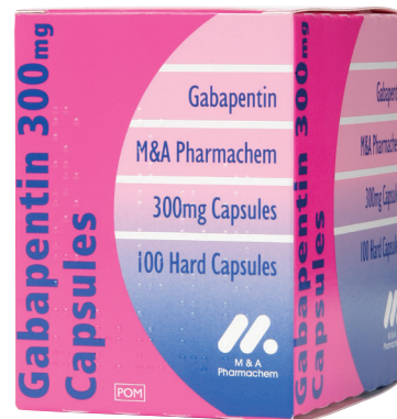
Gabapentin 300mg Capsules