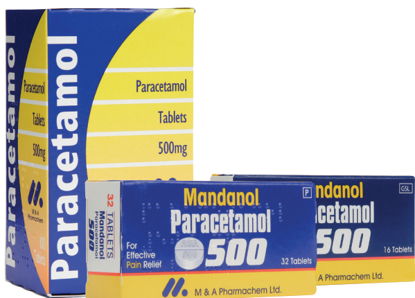
Paracetamol 500mg Tablets Blister