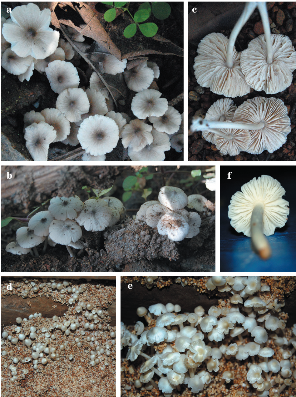
Fig. 3. Termitomyces microcarpus (large form): a, b – gregarious mature fruitbodies, c – stipe and gills (India, Western Ghats, shola forest of Sampaje, Kodagu, 22 Sep. 2012, leg. N.C. Karun, MUBS 031); T. microcarpus (small form): d – early stage of spawn with asexual granules with immature fruitbodies developed on termite faecal pellets, e – mature fruitbodies with silky cap, f – gills (India, Western Ghats, B'Shettigeri, 20 Nov. 2012, leg. N.C. Karun, MUBS 032).