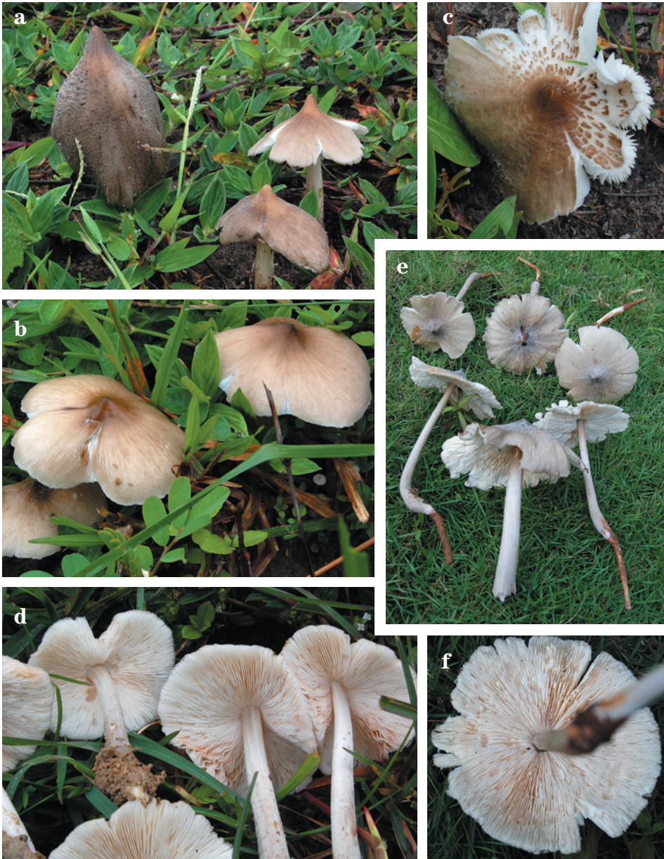
Fig. 1. Termitomyces clypeatus : a – emerging stage, b – expanded stage, c – characteristic cap surface, d – stipe and gills (India, Western Ghats, B'Shettigeri, 26 Jul. 2012, leg. N.C. Karun, MUBS 028a); T. clypeatus : e – cap and stipe, f – gills (India, west coast, Konaje, 14 Aug. 2012, leg. N.C. Karun, MUBS 028b).