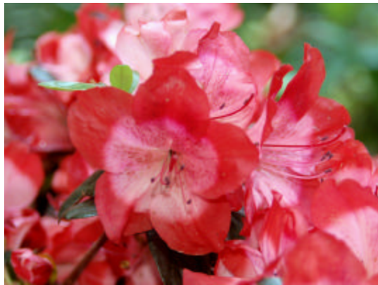
'Pam Corckran' – Expanded Blotch Area

Santamour and Dumuth backcrossed evergreen and deciduous azalea hybrids for multiple generations. [19] There was evidence of carotenes in several of the "yellowest" seedlings, with heaviest concentrations in the blotch region. This could imply that breeders should seek azaleas with expanded blotch areas in their quest for yellow. Marshy Point's 'Pam Corckran' has a blotch that extends to at least 75% of the corolla. It may prove useful in developing azaleas with expanded blotch areas, ones that could help concentrate those carotenoid pigments for yellow color.