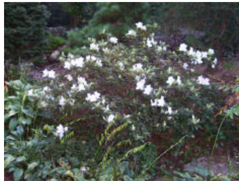
'August to Frost' – Plant