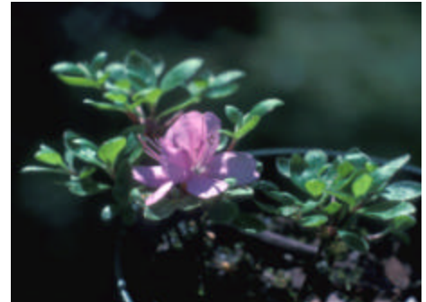
( nakaharae x kiusianum album )