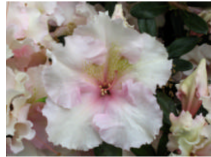
‘Sandy Dandy’

Fuchsia.’ Instead of the hardy bicolor he sought, Joe got many buff-colored seedlings including ‘Sandy Dandy.’ The brilliant purple of ‘Girard’s Fuchsia’ could be caused by flavenols intensifying the anthocyanin. When the purple pigment was not expressed in certain seedlings such as ‘Sandy Dandy’, perhaps the yellowish flavenols became more noticeable to give the unusual coloration.