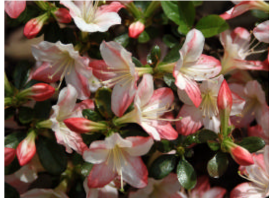
Creech's New Kurume: 'Wakaebisu'

John Creech shared Morrison's admiration for evergreen azaleas, and from 1955 to 1980 made at least 5 collecting trips to Japan. In 1983, the U.S. National Arboretum released 33 of Creech's new Kurumes, but these are only now gaining popularity. The Creech introductions are exquisite. 'Fukihiko' and 'Tokoharu' have striped flowers, and 'Itten' is white with lavender border. There has also been some confusion about these plants. 'Wakaebisu' has delicate single white flowers brushed with red, but there was already a familiar hose-in-hose salmon Satsuki with the same name.