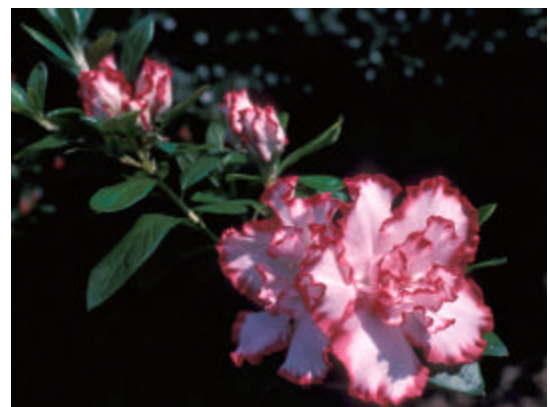
‘Leopold-Astrid’ (Red edge is 4n)

Tetraploid azaleas are usually solid colors which could cause problems when breeding for bicolors. Bicolor flowers like ‘Leopold-Astrid’ have two tissue types: the white center is diploid but the contrasting red edge is tetraploid. [8]