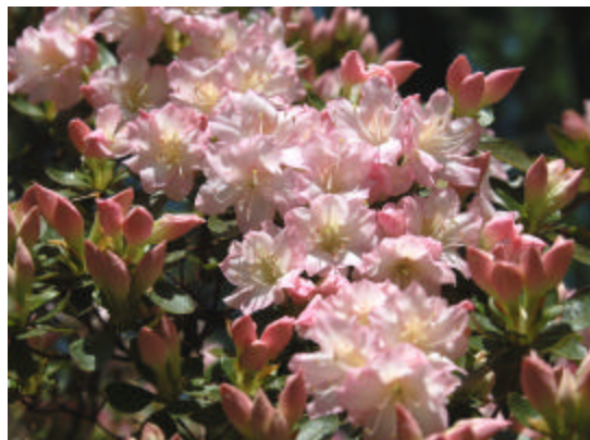
Beattie's 'Cherryblossom' - 'Ogi-kasane'

Beattie at the U.S. Department of Agriculture imported another 127 Japanese azaleas including 60 Kurumes. Only 11 Beattie Kurumes were duplicates of the Wilson or Domoto azaleas. [10][17]