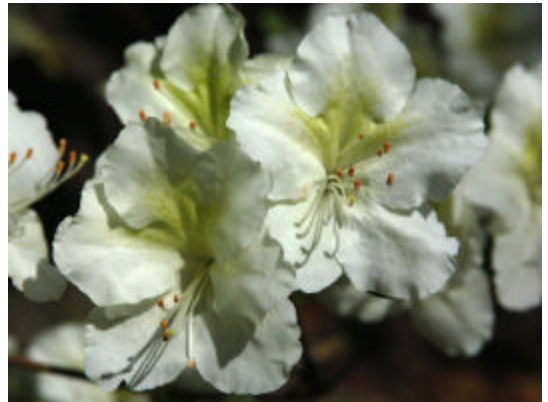
('Gunka x "Pryor Yellow"')