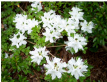
R. kiusianum album