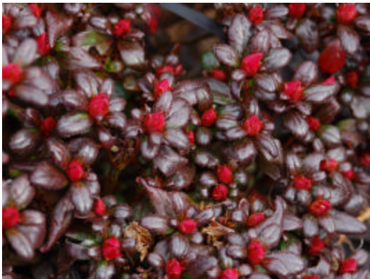
Foliage of Hachmann's 'Marushka'

Since the flowering season lasts but a short time, people are interested in the year-round landscape effect of garden plants. There are many different leaf types in evergreen azaleas, and this offers many options for developing unusual foliage forms.