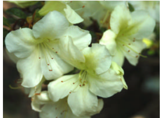
('Banka x "Pryor Yellow"')