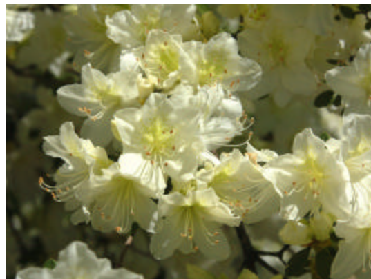
Unnamed Cream Glenn Dale on Mt. Hamilton