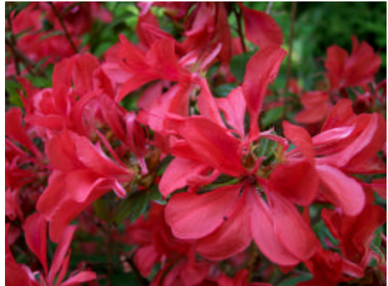
Hyatt hybrid: 'Cardinal's Crest'

Strap-petal hybrids can arise when neither parent shows that tendency. The author's cross ( R. nakaharae x 'Anna Kehr') produced the desired compact double pink, 'Ginny Grina.' It also produced a plant with red petaloid flowers, 'Cardinal's Crest.'