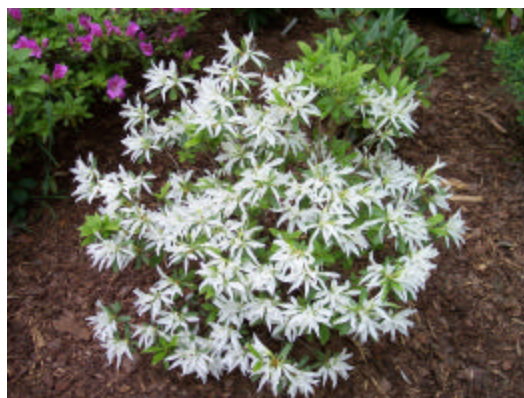
Hyatt introduction: 'Wagner's White Spider'

An azalea flower form becoming popular in the United States is the strap-petal, or "spider" type, where the corolla is separated into distinct petals. The popular lavender spider, 'Koromo-shikibu,' has been used frequently in hybridizing.