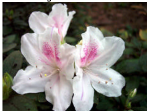
'August to Frost' – Sport