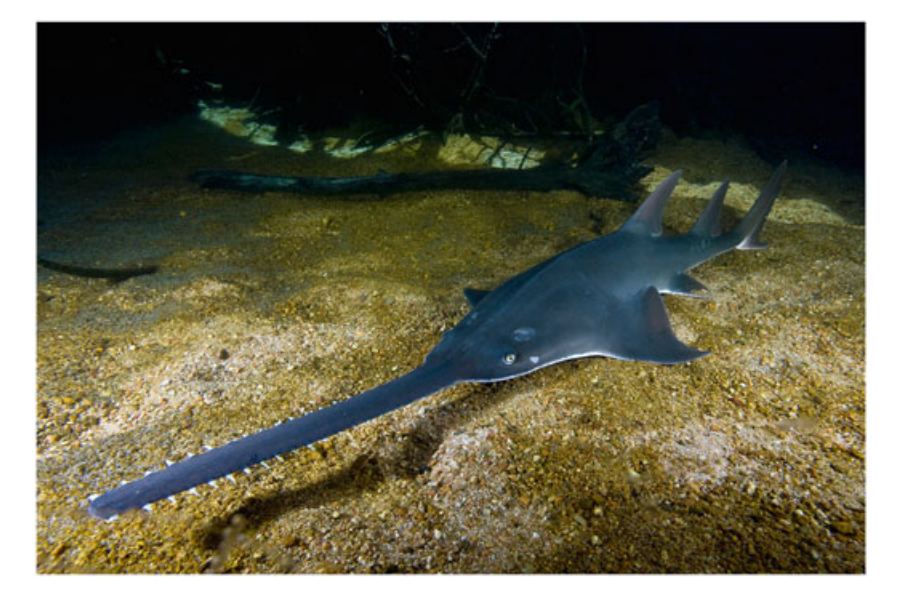
Figure 4. Largetooth sawfish Pristis pristis in an aquarium.

Caribbean coral reefs have lost 80% of coral cover and complexity in the past half century, owing to a combination of urchin outbreak and die-off, hurricanes, disease and coral bleaching induced by climate change (Gardner et al. , 2003; Alvarez-Filip et al. , 2009), which has led to annual declines in fish abundance of 2.7-6% (Paddack et al. , 2009). As a consequence of widespread coral loss over the 1998 ENSO event, up to a third of reef-building corals have declined in cover to the point where they were categorized in one of the IUCN Red List threatened categories (Carpenter et al. , 2008).