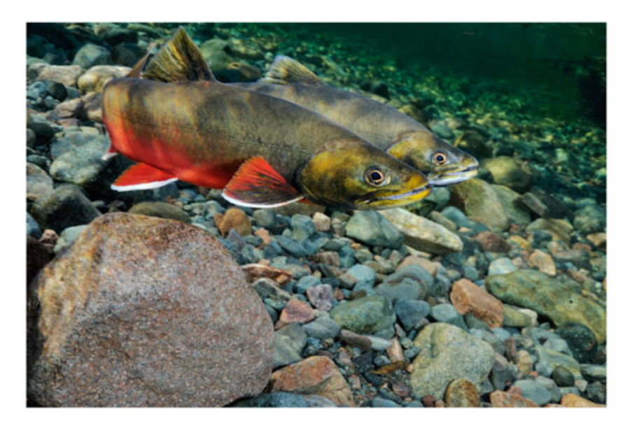
Figure 2. A pair of Arctic charr Salvelinus alpinus (male in the foreground) near their spawning ground in the inflowing River Liza of Ennerdale Water, U.K. Photograph © Linda Pitkin/naturepl.com. Published with permission.

In the marine realm the principal threats are overfishing and habitat loss, based on syntheses of threatened North American marine fishes (excluding salmonids, Musick et al. , 2000) and a global analysis of 65 local, regional and global marine extinctions (Dulvy et al. , 2003) (Figure 3).