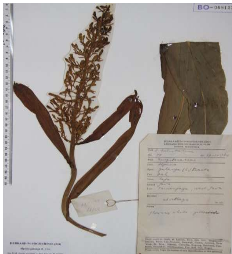
Figure 3: Family: ZINGIBERACEAE Botanical Name: A. galanga

Specimens examined.— INDONESIA, West Java, Kebun Obat Unik Konservasi Budidaya Biofarmaka IPB Darmaga Bogor, 250 m alt., Taopik Ridwan s.n. , 2 sheets (BO); Indonesia, West Java, Tamanjaya, 29 Jan. 1984, D. Sulistiarini 79 (BO); Indonesia, West Java, Jasinga, Haur Bentes, 300 m alt., 20 March 1986, Indarto 6, 2 sheets (BO); Indonesia, Cultivated in Djerokarta, leg.ign. s.n. (BO); Cultivated in Hort. Bog. Java, C.H.B. No. XV. K.B. LX VII. 5 , 2 sheets (BO).