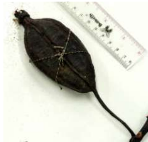
Fig. 8 (top left). Dorsal sepal of G. speciosum from Bogor. Fig. 9 (top right) Petal. Fig. 10 (bottom left). Lip. Fig. 11 (bottom right). Capsule.