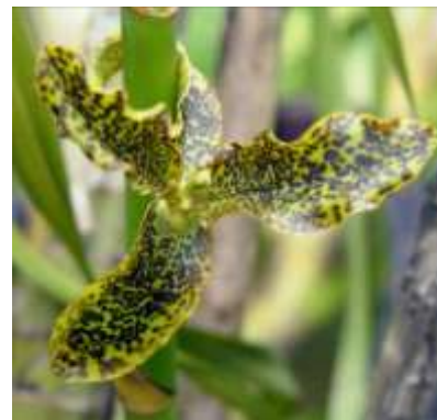
Fig. 3 (left). Inflorescence of G. speciosum from Bogor. Fig. 4 (top right). Normal flower (front view). Fig. 5 (bottom right). Abnormal flower.