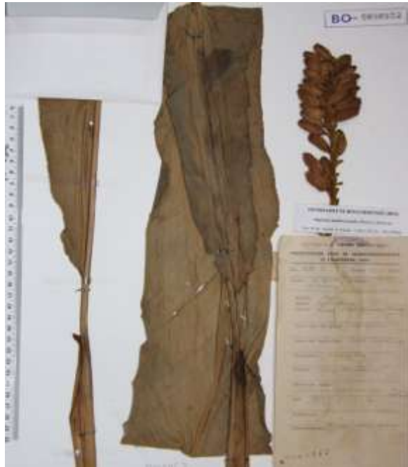
Figure 2: Family: ZINGIBERACEAE Botanical Name: A. malaccensis