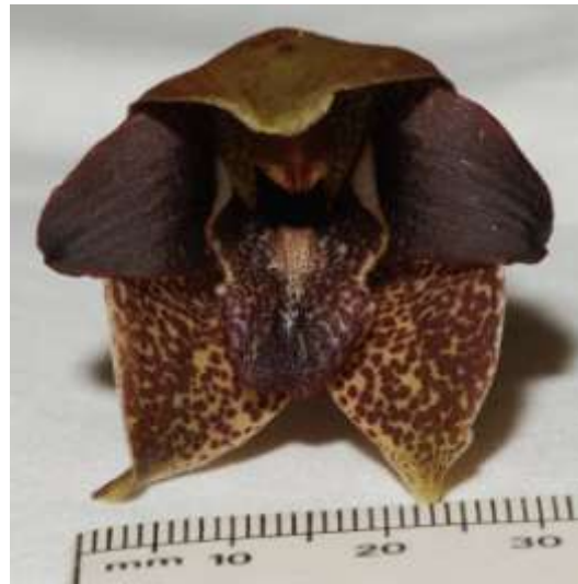
Fig. 6 (left). Inflorescence of G. stapeliiflorum from Peninsular Malaysia. Fig. 7 (right). Flower (front view).