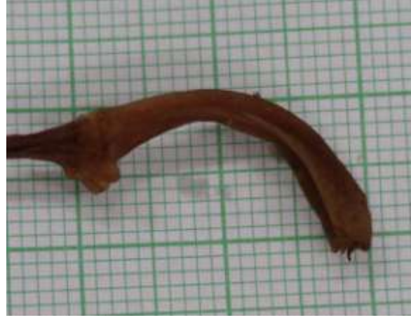
Fig. 12 (top left). Dorsal sepal of G. stapeliiflorum from Bogor. Fig. 13 (top right) Petal. Fig. 14 (bottom left). Lip. Fig. 15 (bottom right). Column (side view).