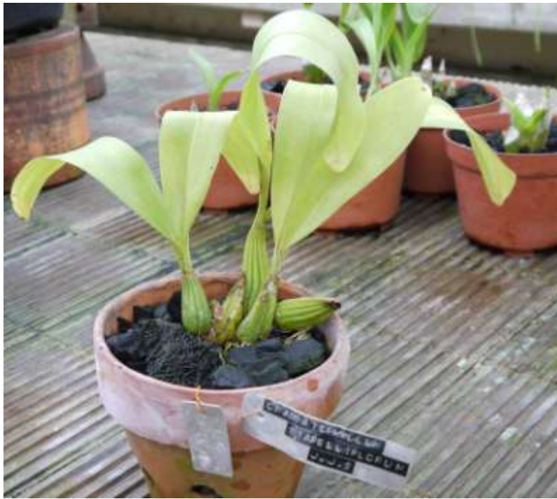
Fig. 2. Habit of G. stapeliiflorum from Orchid house in Bogor Botanical Gardens.