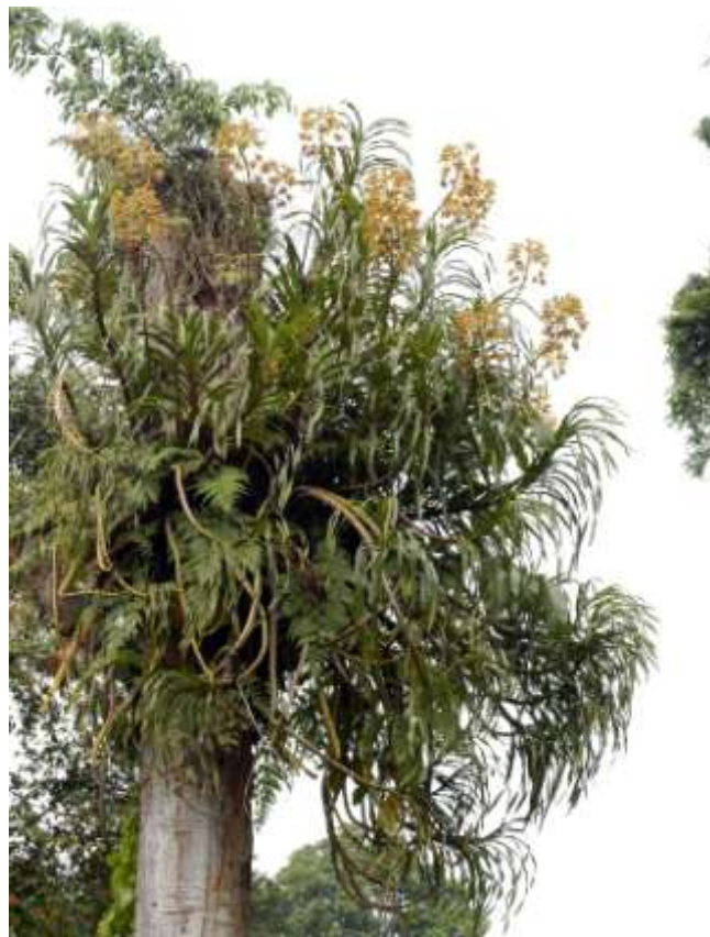
Fig. 1. Large specimen of G. speciosum growing in Bogor Botanical Gardens.

WCSP (2012). World Checklist of Selected Plant Families . Facilitated by the Royal Botanic Gardens, Kew. Published on the Internet; http://apps.kew.org/wcsp/ Retrieved 15 th of March, 2012