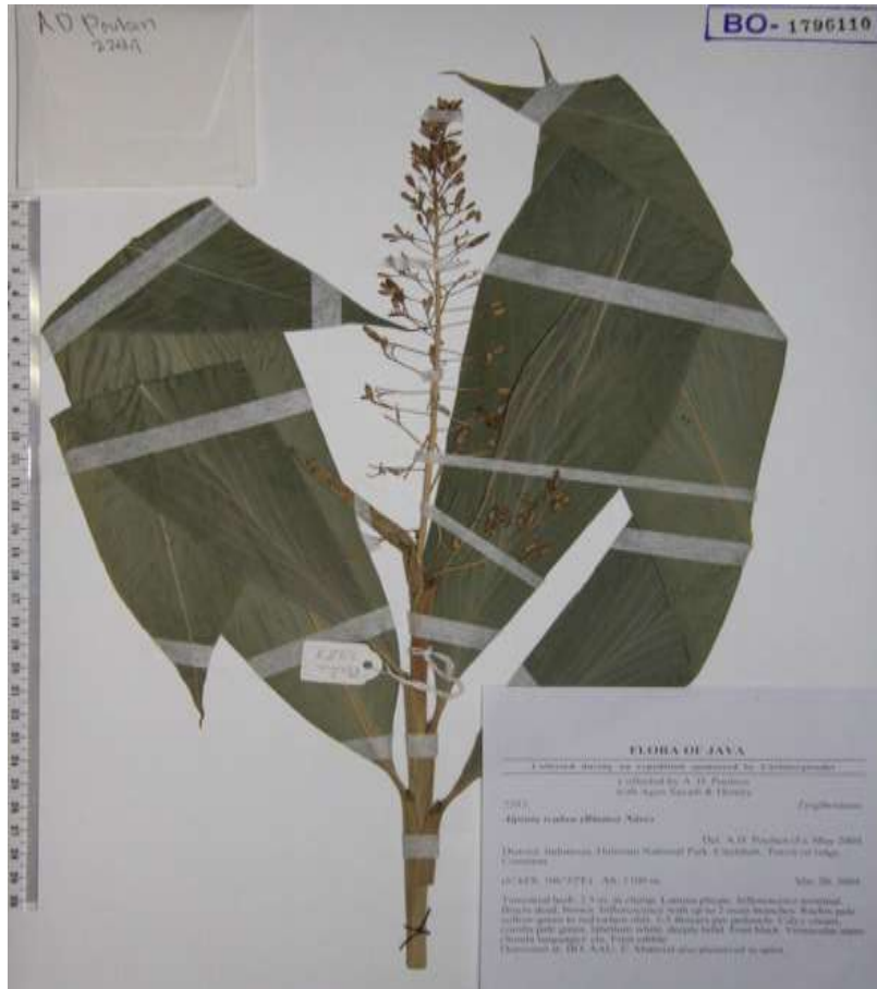
Figure 4: Family: ZINGIBERACEAE Botanical Name: A. scabra