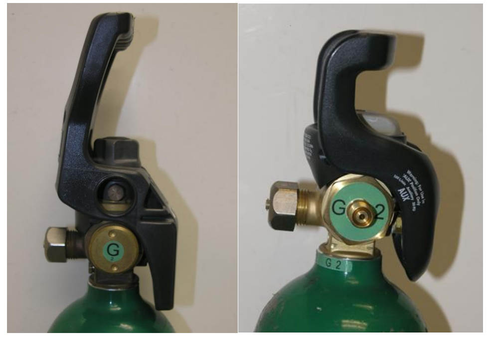
OxyTOTE and OxyTOTE

In addition, a green "G" label will be affixed to BOTH the Oxygen cylinder AND the regulator body to facilitate efficient identification of remediated product during and after the recall.