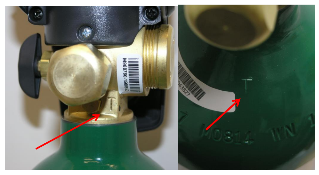
OxyTOTE with "T" stamp on regulator

<u>ALL</u> OxyTOTE/oxyQuik/AirTOTE products are subject to this recall <u>EXCEPT</u> units that are marked with a hard stamped "T" on BOTH the Oxygen cylinder AND the brass portion of the regulator body. Refer to the following illustrations. These OxyTOTE units were manufactured from October 2014 to date, and are NOT subject to this recall action.