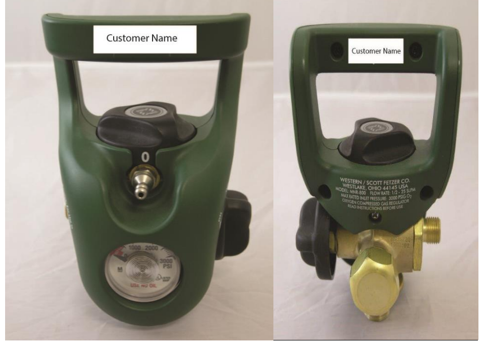
Customer "private label"" replaces "OxyTOTE