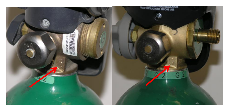
OxyTOTE and OxyTOTE

Upon completion of the remediation under this recall, all OxyTOTE product will be hard stamped with a "G" on BOTH the Oxygen cylinder shoulder AND the regulator body.