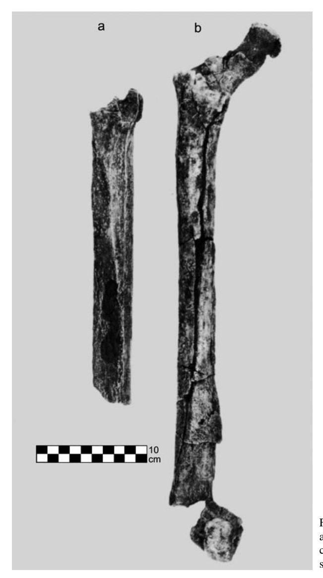
Figure 1 - Casts of (a) KNM-ER 736 and (b) KNM-ER 999, with the lateral condyle (piece D) attached to the shaft, although no bony contact exists.

below the lesser trochanter, I obtained anteroposterior and transverse diameters of 34.0 mm and 35.1 mm for KNM-ER 736, and of 37.5 and 34.0 mm for KNM-ER 999. Whereas the transverse diameters are very similar in the two bones, the anteroposterior diameters seem to be smaller in KNM-ER 736. This is, however, due to a more medially situated linea aspera in this specimen. If maximum diameter is used instead of anteropostenor diameter, I once more obtain very similar values for KNM-ER 736 and 999: 37.6 mm and 38.4 mm, respectively, at midshaft, and 38.6 mm and 37.8 mm, respectively, at about 20.6 mm below the lesser trochanter.