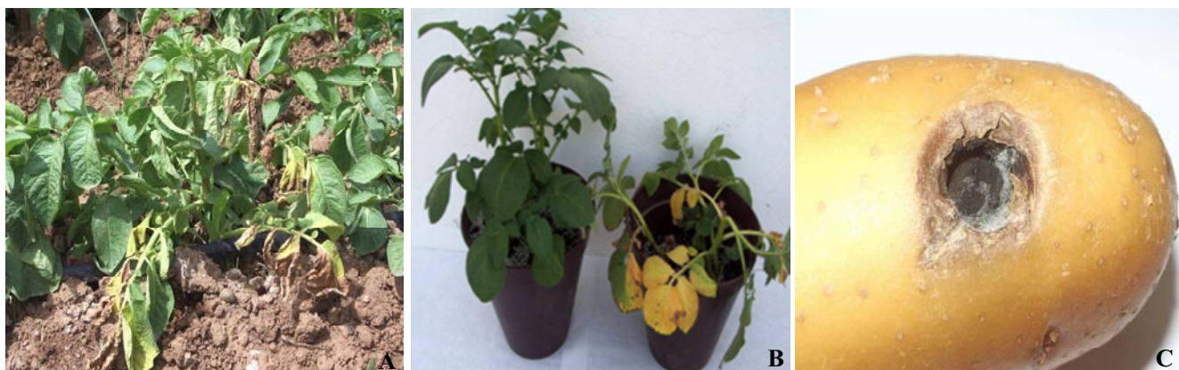
Fig. 2 Potato plants naturally infested with V. tricorpus and V. dahliae (A); Comparison between a noninoculated potato plant (left) and a plant inoculated by an isolate of V. tricorpus (right) (B) (cv. 'Spunta', 60 days after inoculation; 5°C<T<28°C); Dry rot developed on a potato tuber cv. 'Spunta' 30 days after its inoculation with V. tricorpus (C).

Japan (Ebihara et al. 2003). In Tunisia, V. tricorpus has been isolated from wilting tomato and melon plants (Jabnoun-Khiareddine et al. 2005, 2007) but this is the first report from potato plants and tubers in North Africa.