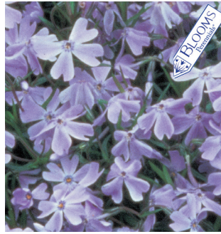
Phlox subulata 'Oakington Blue Eyes'