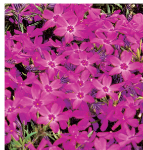
Phlox subulata 'Crimson Beauty'