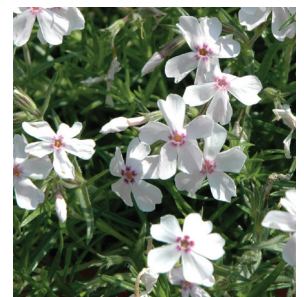
Phlox subulata 'Amazing Grace'