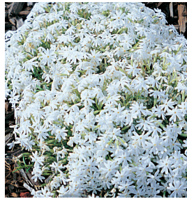
Phlox subulata 'Snowflake'