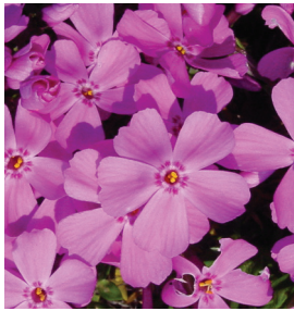
Phlox subulata 'Emerald Pink'