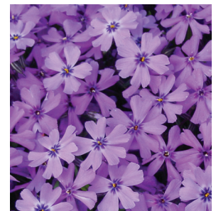
Phlox subulata 'Purple Beauty'