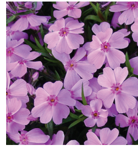
Phlox subulata 'Ronsdorfer Beauty'