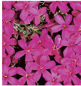
Phlox subulata 'Atopurpurea'