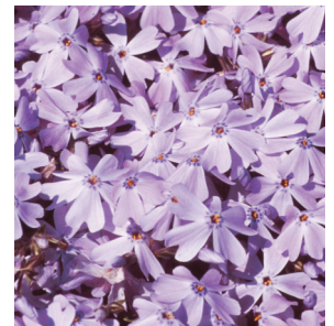
Phlox subulata 'Emerald Blue'