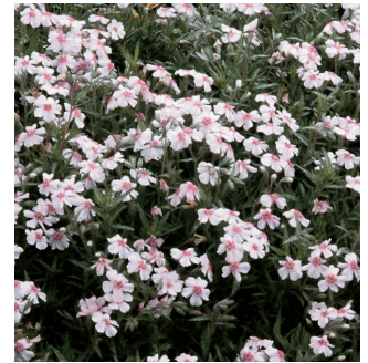
Phlox subulata 'Coral Eyes'