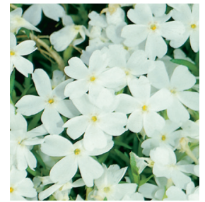
Phlox subulata 'White Delight'