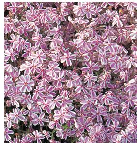
Phlox subulata 'Candy Stripe'