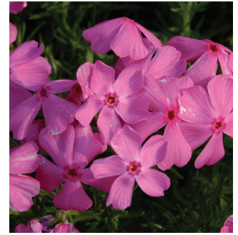
Phlox subulata 'Drummon's Pink'