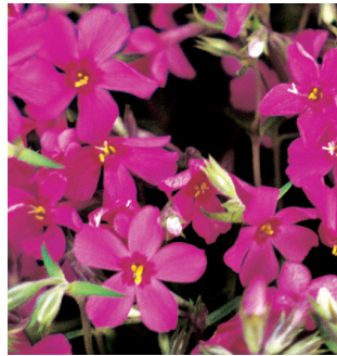
Phlox subulata 'Millstream Daphne'