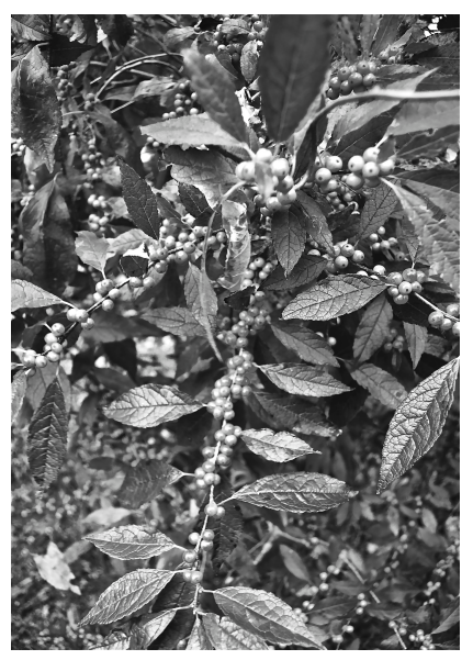
I. Verticillata 'Winter Gold' at Holly Haven.