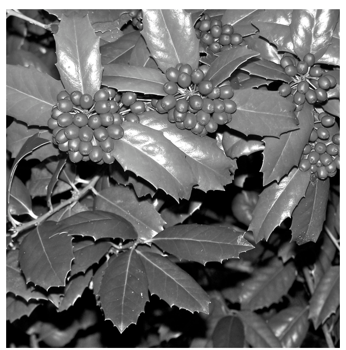
Ilex [(cornuta 'Burfordii') x latifolia] 'Bessie Smith'.