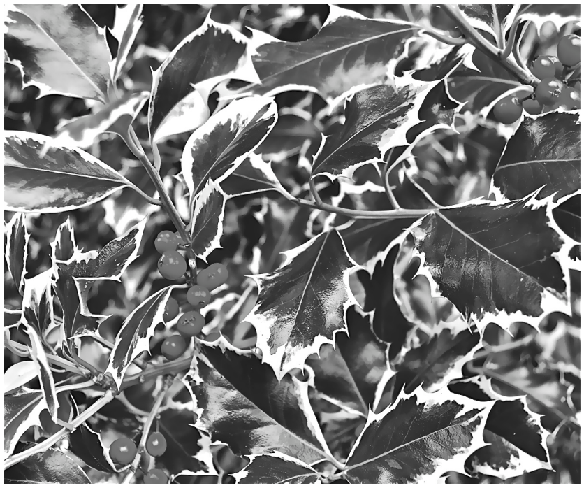
English Variegated Holly ( Ilex aquifolium 'Aurea Marginata') at Holly Haven.