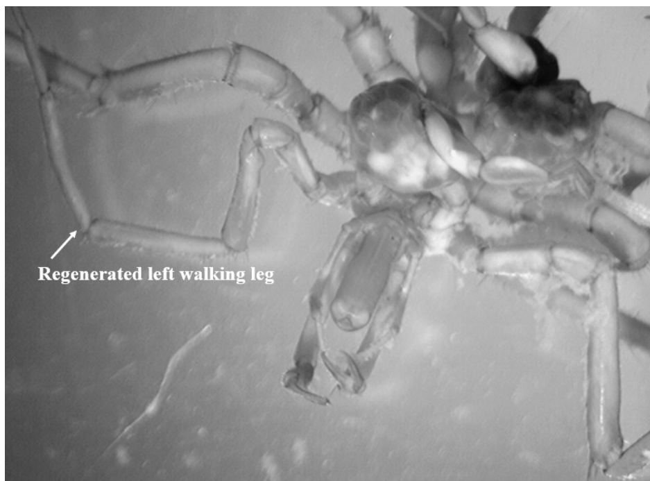
Fig. 2 A ventral view of N. australe with a regenerated left first walking leg. This limb is shorter and thinner than the other walking legs.