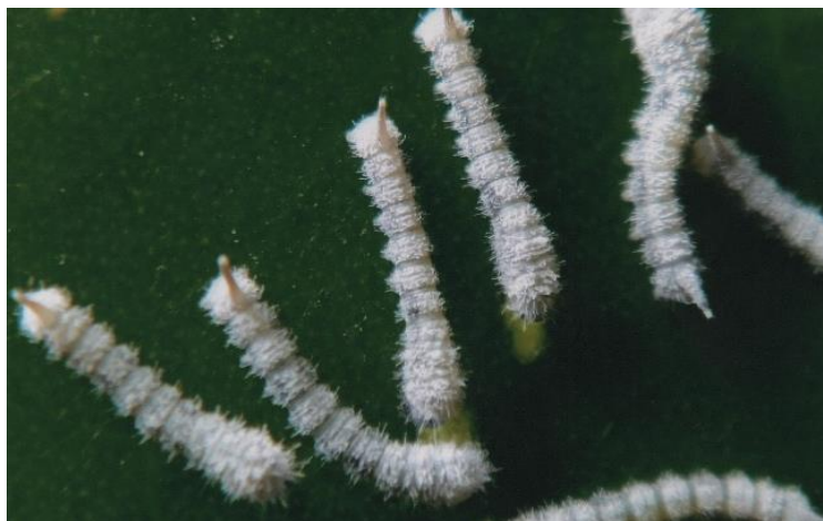
Fig 2 Eruciform caterpillars, with short, straight, and small caudal horn.