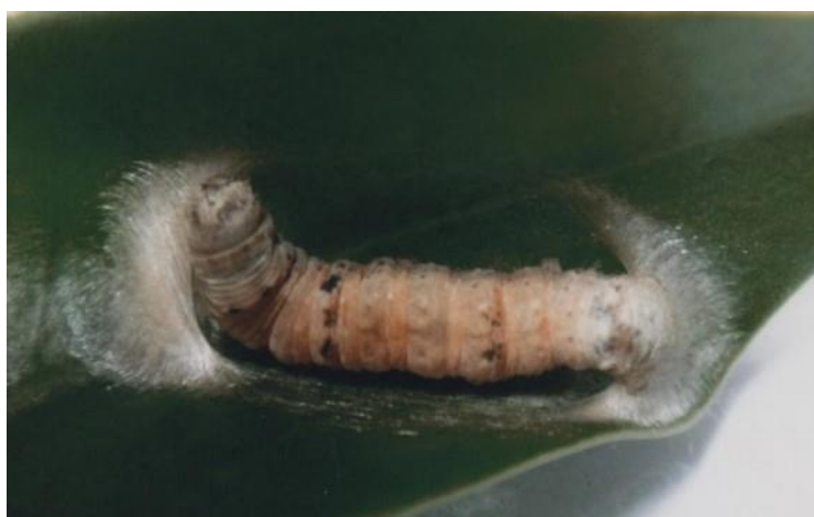
Fig. 3 Characteristics of cocoon