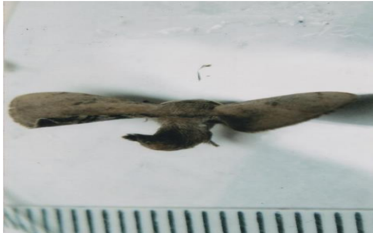
Fig 4 The tip of the abdomen is bent upward