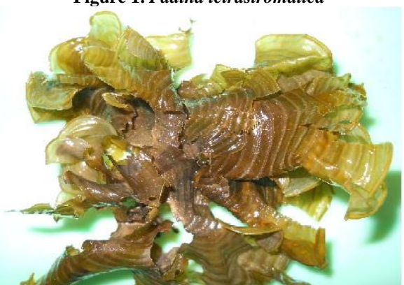
Figure 1. Padina tetrastromatica