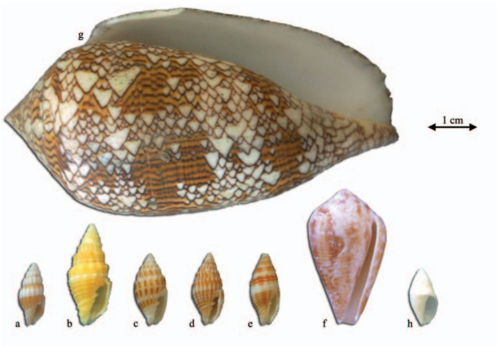
Fig. 3. a) Vexillum gorii , b) V. crocantum , c) V. speciosum , d) V. unifascialis , e) V. u. affinis , f) Conus retifer , g) Bullia ancillaeformis , h) Conus textilis .