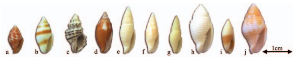
Fig. 2. a) Mitra chrysalis , b) M. coarcta , c) Peristernia hilaris , d) M. floridula , e) M. isabella , f) M. picta , g) Cancilla carnicolora , h) Pterygia pudica , i) Swainsonia bicolor , j) Mitra rubritincta .