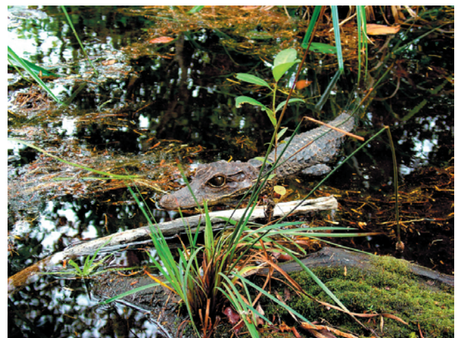
Figure 3. Juvenile O. tetraspis .

Very little is known about the ecology and natural history of the dwarf crocodile. Insufficient data have been collected from any region to describe the ecology of a particular species, so only general information on the genus Osteolaemus is provided here. As its name implies, the dwarf crocodile is a diminutive species, with a maximum size rarely exceeding 2.0 m. Its small size and generally dark coloration are presumably evolutionary adaptations allowing the dwarf crocodile to reside in small, cool streams under closed-canopy rainforest. In contrast to the broadly sympatric Nile ( Crocodylus niloticus ) and Slender-snouted crocodiles ( C. cataphractus ), dwarf crocodiles occupy dense swamps and flooded forests (Waitkuwait 1989; Luiselli et al. 1999; Riley and Huchzermeyer 1999; Eaton 2006). Dwarf crocodiles have also been observed using isolated savanna pools, small pools in perennial forest streams, larger open-canopy rivers, forest lakes and coastal lagoons (Waitkuwait 1989; Kofron 1992; Thorbjarnarson and Eaton 2004; Eaton and Barr 2005; Eaton 2006; Shirley 2007; Shirley et al. 2009).