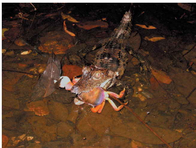
Figure 4. Juvenile O. teraspis feeding on a crab.

Diet consists primarily of invertebrates, with a smaller representation of vertebrates. In one study, nearly 55% of the diet was comprised of gastropods and crabs, with frogs and fish making up an additional 40% (Luiselli et al. 1999). Minor differences in diet were also seen between adult males, adult females and juveniles. Pauwels et al. (2007) reported invertebrates (insects, millipedes and crustaceans) making up 79.1% of the diet at one site, with bony fishes adding 8.7% and amphibians and mammals a combined 11.1%. At a second site, crustaceans comprised nearly 100% of the diet in a sample of 8 crocodiles (Pauwels et al. 2007). Riley and Huchzermeyer (2000), reporting on the stomach contents of 16 wild dwarf crocodiles sampled in the field and in local bushmeat markets, revealed a wide range of invertebrate and vertebrate prey including insects, gastropods, spiders, birds, snakes, mammals, amphibians and fish.