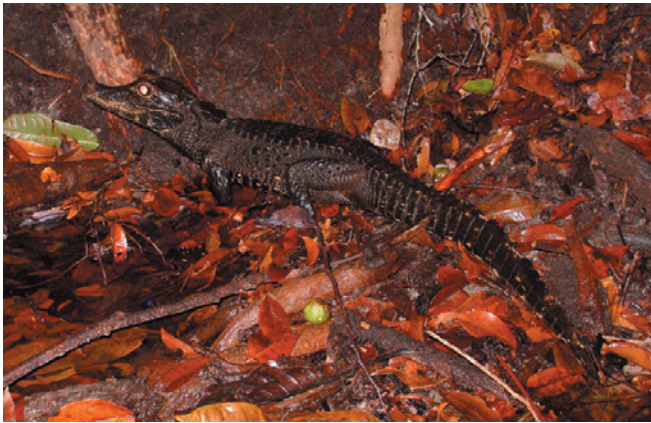
Figure 2. Juvenile O. tetraspis .

Principal threats: Widespread and intensive subsistence hunting and the commercial bushmeat trade, habitat loss.