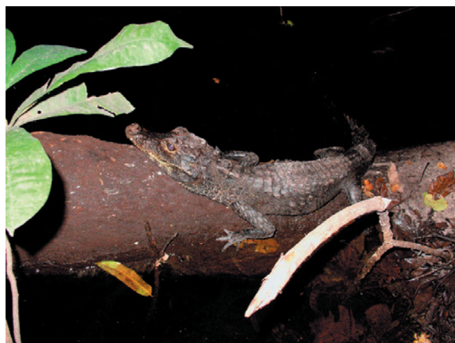
Figure 5. Juvenile O. tetraspis .

Despite the difficulties of managing a widespread and often surreptitious trade in dwarf crocodiles, creative management alternatives are needed to mitigate unsustainable harvesting as currently practiced. Because crocodiles and other bushmeat species serve as an important subsistence resource for rural inhabitants, context-appropriate management guidelines are needed, in addition to reducing illegal commercial harvest through enforcement, to ensure dwarf crocodiles remain viable in Central and West African forests. Several countries permit legalized harvest of dwarf crocodiles for local consumption (eg Gabon, Republic of Congo), but this is rarely part of a well-considered management plan and almost never backed by quantitative estimates of population size or harvest rates. Legalized international trade in live dwarf crocodiles for the zoo industry is permitted by CITES but has principally involved trade in captive-bred animals among developed nations (eg 18 live dwarf crocodiles traded in 2007 from Spain to Thailand, www.cites.org ). Export permits of manufactured leather products over the last decade have declined from 27 in 1997 to 0 in 2007. Plans for captive breeding programs for conservation, tourism and possible meat production (Togo, Cameroon, Nigeria, Ghana) seem to have been stalled, though there has been recent discussion of a breeding program in The Gambia that holds promise.