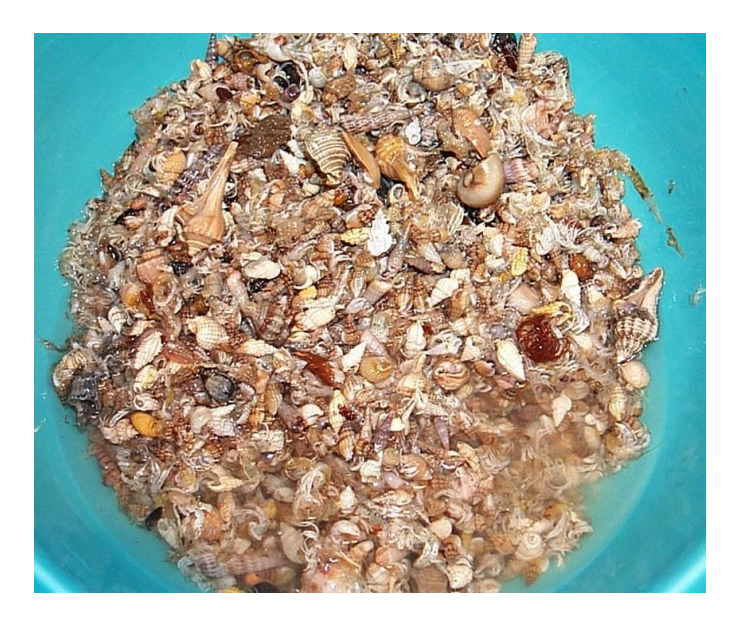
The 3,952 shells obtained from the "Remarkable Catch"

At final count, I recorded an amazing 3,952 shells with 2,088 being Nassarius acutus for 53% of the total. The 1,864 other shells were distributed among 59 different species.