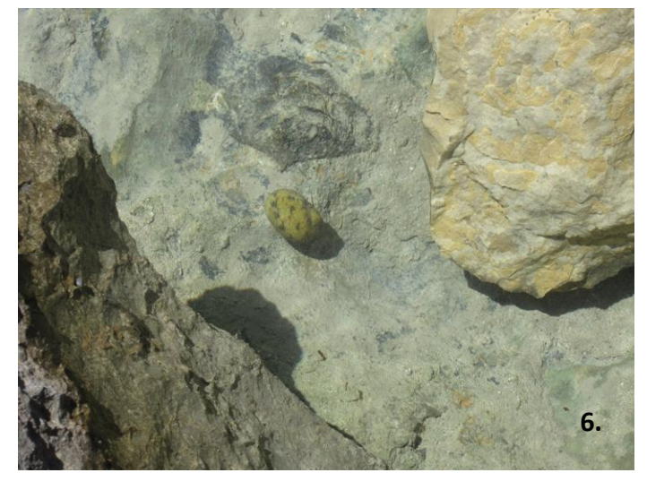
Living Nerita versicolor in situ