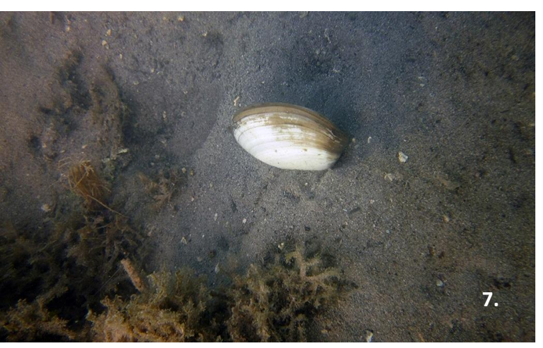
Living Tellina fausta in situ