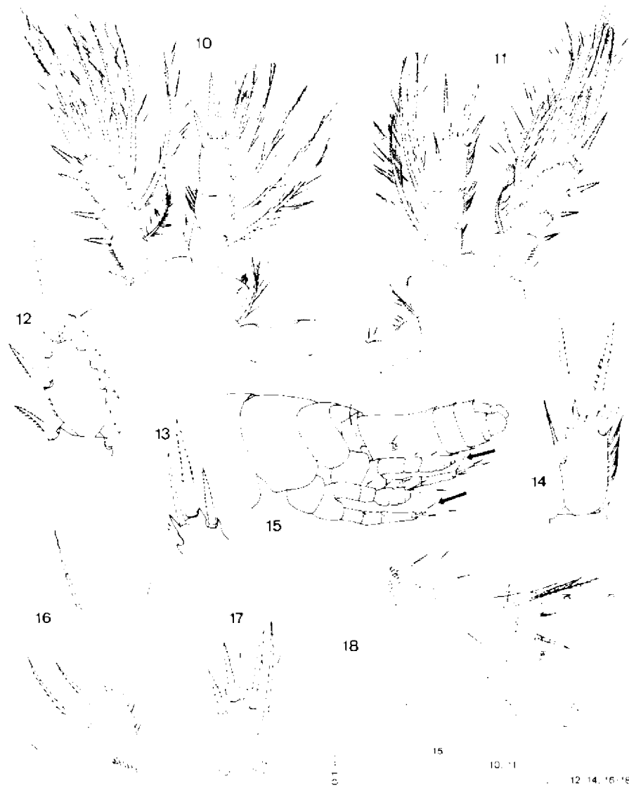
Fig. 10-18 — Halicyclops aberrans new species. Female: 10, third leg; 11, fourth leg; 12, third exopodal segment of fourth leg (Ex3 P4); 13, terminal portion of third endopodal segment of third leg (En3 P3); 14, third endopodal segment of fourth leg (En3 P4); 15, posterior region of body, lateral (black arrows indicating the position of inner apical spine of En3 P3 and p4); 16, fifth leg. Male: 17, En3 P4; 18, anterior part of urosome showing fifth and sixth legs, lateral.