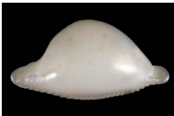
15-18. P. cicercula , 13.5 mm, French Polynesia, Tuamotu, Fakarava Atoll