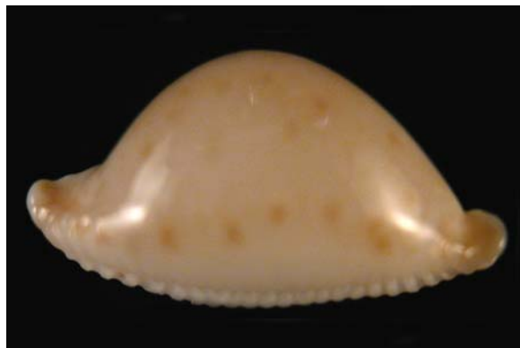
6-9. Pustularia margarita (Dillwyn, 1817), 18 mm, the Philippines