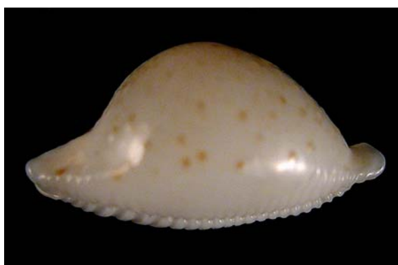
19-22. P. cicercula , 13.7 mm, French Polynesia, Tuamotu, Takapoto Atoll