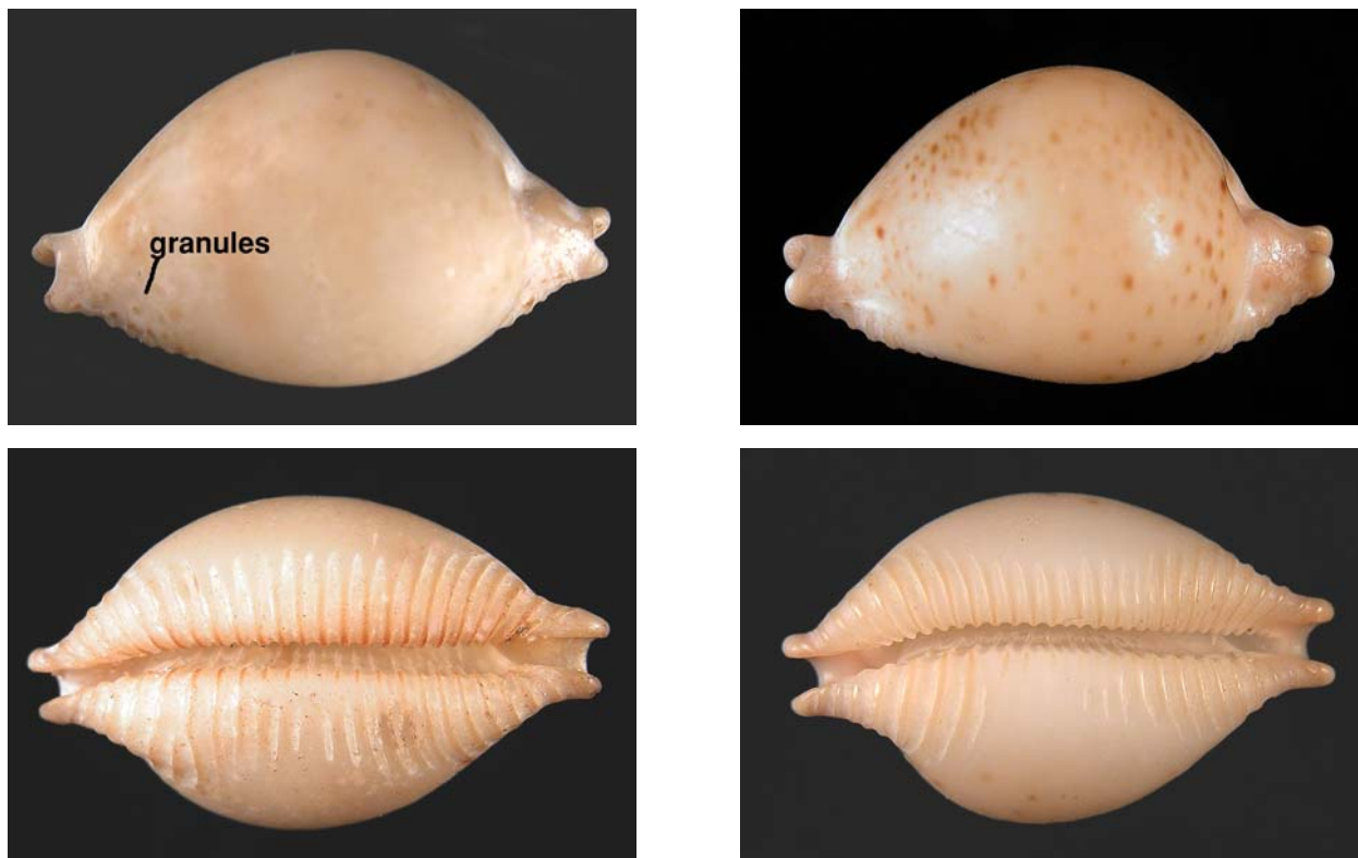
23-26. P. cicercula , 18.6 and 16.5 mm, the Hawaiian Islands, Maui