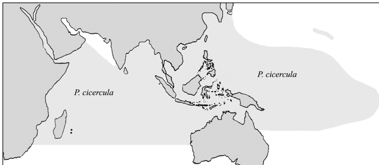
1. A distribution range of P. cicercula including the smooth form

Pustularia cicercula (Linnaeus, 1758) is widely distributed in the Indo-Pacific region (Fig. 1).