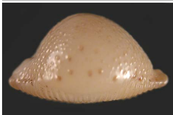
2-5 Pustularia cicercula , 16.5 mm, Phuket, Thailand