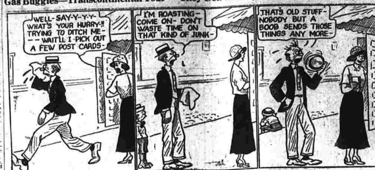
WELL-SAY-Y-Y-Y... WHAT'S YOUR HURRY... TRYING TO OVERTAKE ME... WAIT! I PICK UP A FEW POST CARDS...