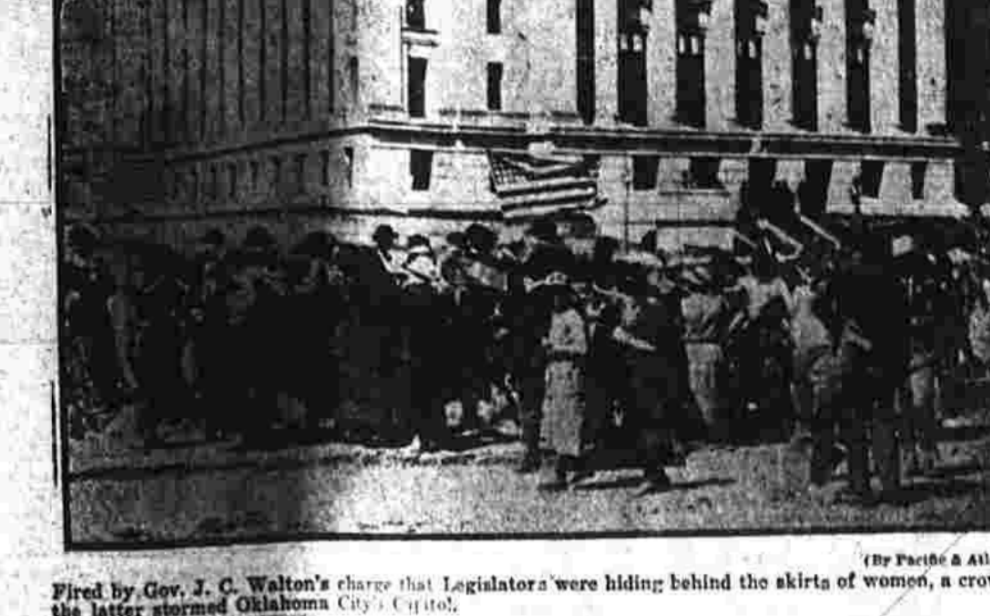
First by Gov. J. C. Walton's charge that Legislators were hiding behind the skirts of women, a crowd of the latter stormed Oklahoma City Capital.